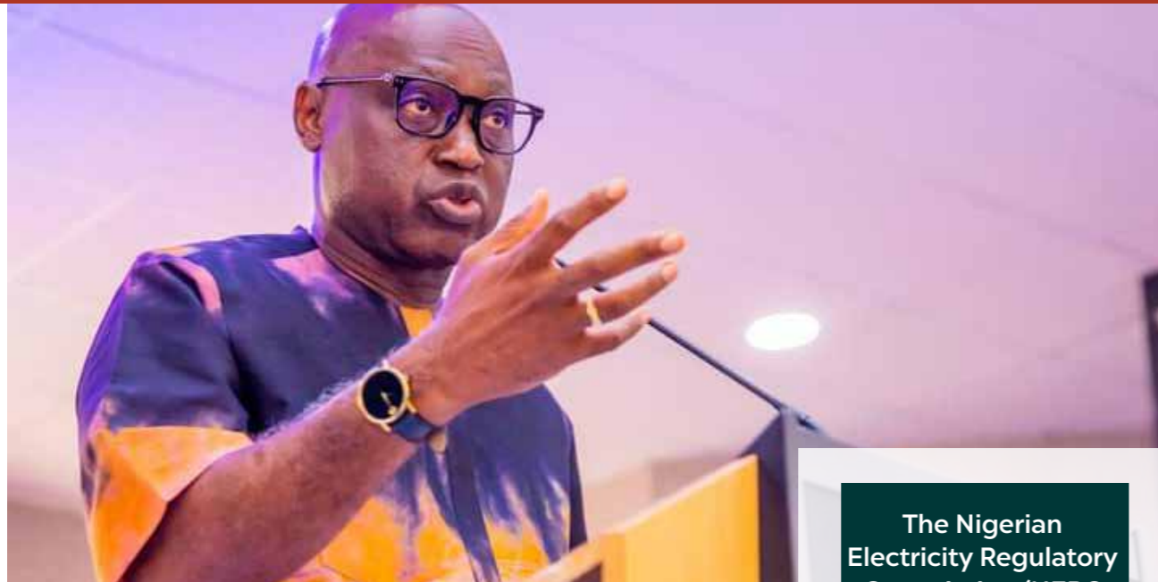
Ekiti State Governor, Biodun Oyebanji

The Nigerian Electricity Regulatory Commission (NERC or the Commission) has issued an order to transfer regulatory oversight of the electricity market in Ekiti State from the Commission to the Ekiti State Electricity Regulatory Bureau (EERB).