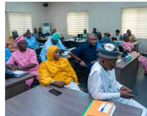
Participants during the Framework for Responsible and Inclusive Land-based Investment in Agriculture (FRILIA) held at the NGF Secretariat, recently.