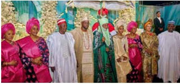
R-L President of Dangote Industries Limited, Alhaji Aliko Dangote; 5th right, Bride's Father, HRH Sanusi Lamido Sanusi, with the new couple and some other family members; and 3rd Left, former Kano State Governor, Senator Rabiu Musa Kwankwaso.