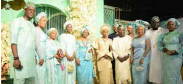
The NGF Secretariat staff at the event