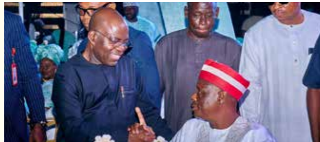
L-R Abia State Governor, Alex Otti; and former Kano State Governor, Senator Rabiu Musa Kwankwaso