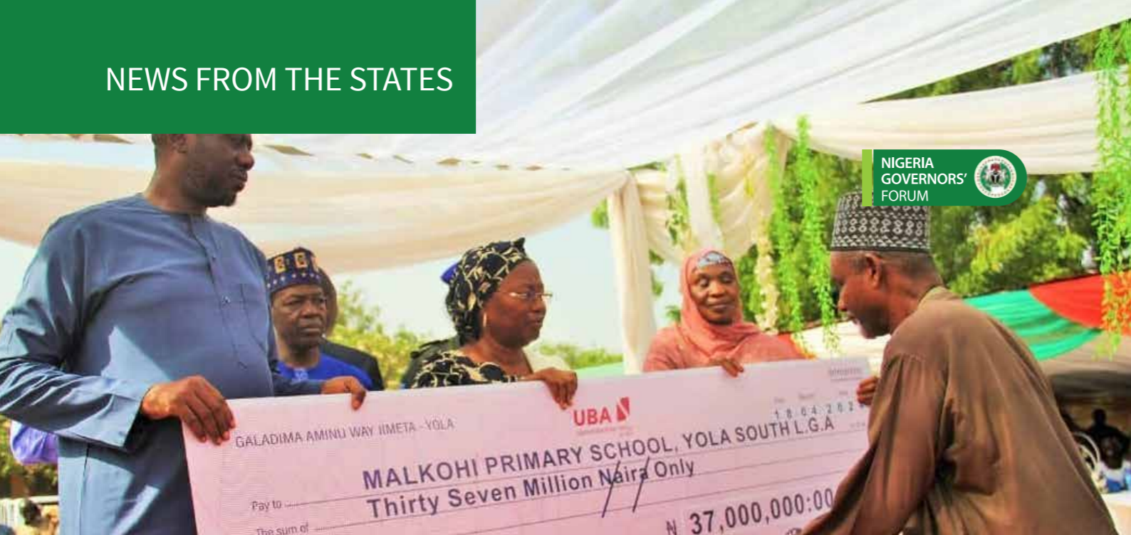
NIGERIA GOVERNORS' FORUM