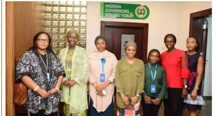
One of our partners, United Nations Children's Fund (UNICEF) came for a meeting with some team members from the Nigeria Governors Spouses' Forum. Their discussions bordered on some of the projects the two organisations are collaborating on.