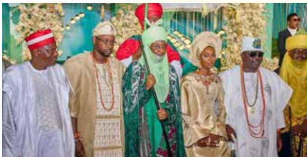
Senator Rabiu Musa Kwankwaso; Bride's father, HRH Sanusi Lamido Sanusi, flanked by the new couple; and Olofa of Offa, HRM Oba Mufutau Gbadamosi.