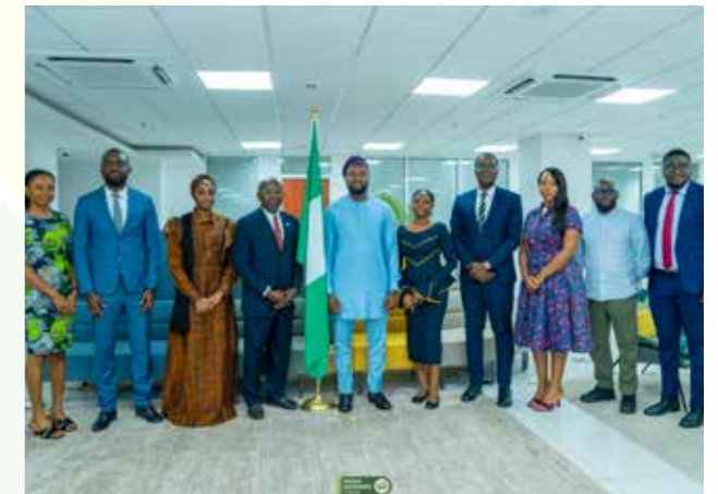
Group photograph by the members of staff of the Nigeria Governors Forum Secretariat and Ministry of communications.