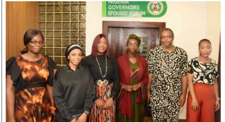
In April some members of the Nigeria Governors Spouses' Forum (NGSF) held a technical meeting with The Joint United Nations Programme on HIV/AIDS (UNAIDS) to advance conversations on a partnership endeavour that will address Mother to Child Transmission of HIV.