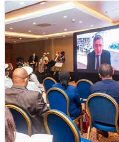
Virtual meeting with NPPN