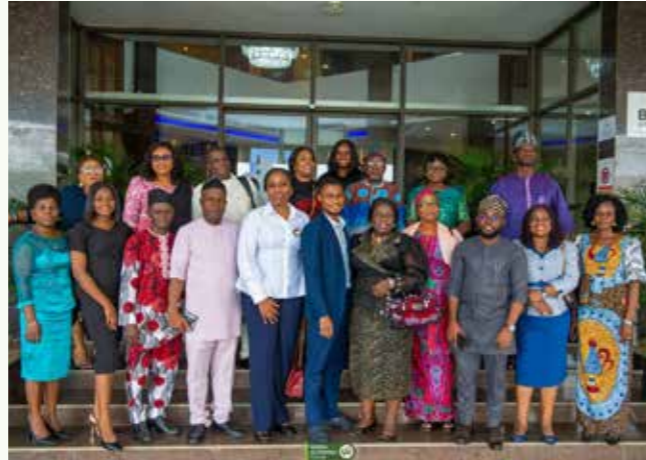
The NGF Health Team with Directors of Planning, Research and Statistics, States Ministries of Health at a recent Two-Day Stakeholder Meeting (Northern Zones).