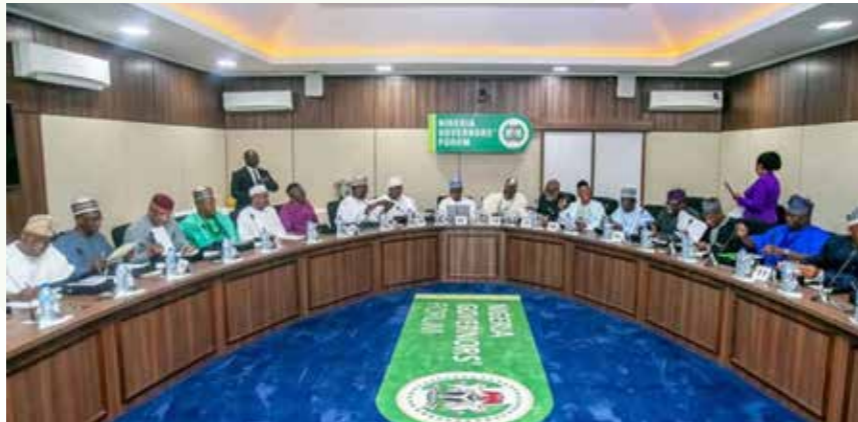
Nigeria Governors' Forum in session

'Members were implored to leverage available support within the program in implementing related reforms to stimulate further economic growth.'