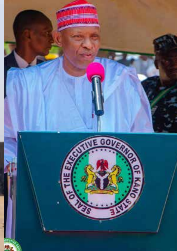
Governor Alhaji Abba Yusuf