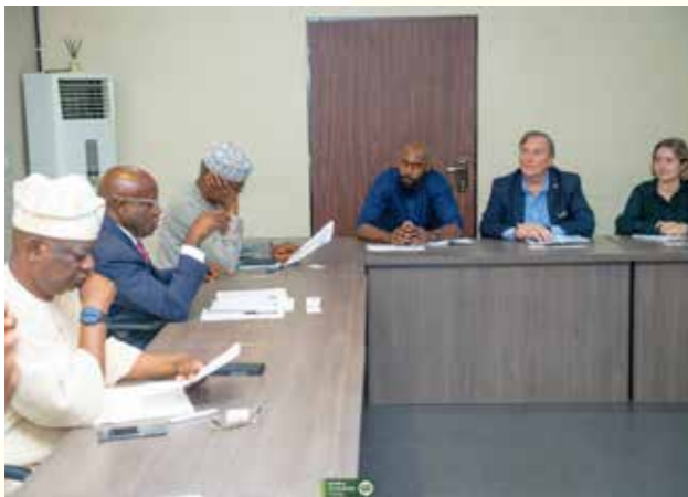
The Nigeria Governors' Forum management team with the Chemonics team during their courtesy visit to The NGF secretariat