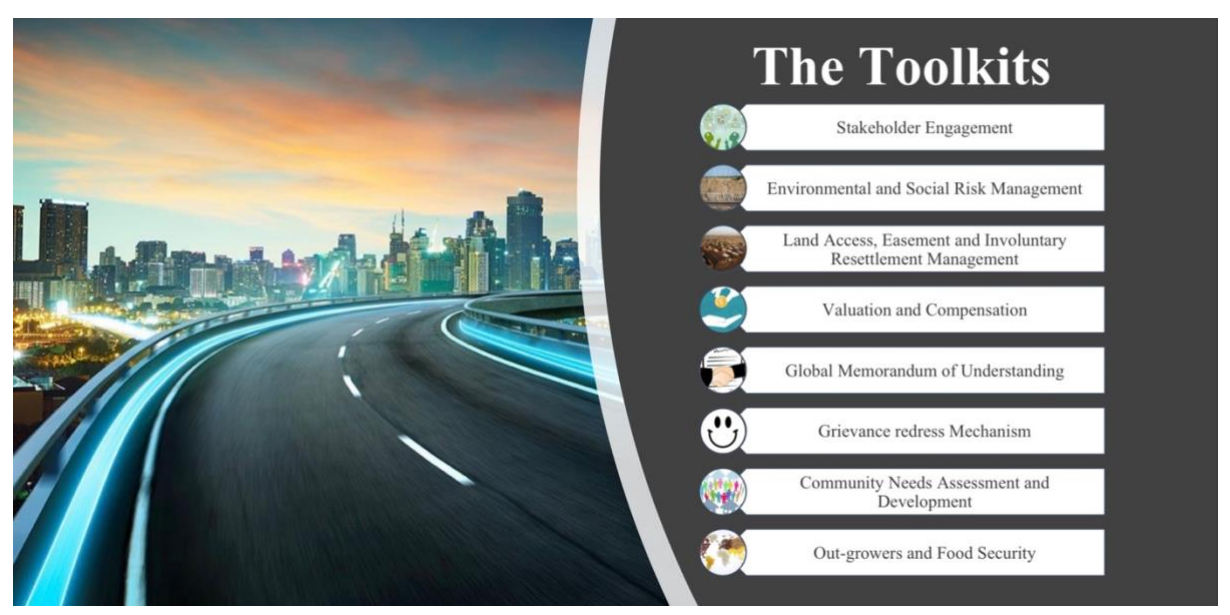
Figure 2: FRILIA Toolkits Developed