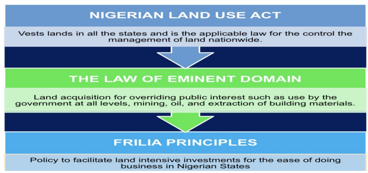
Figure 11: FRILIA within the Legal Space