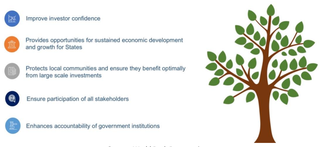
Figure 10: Why FRILIA?

The overall responsibility for developing and implementing FRILIA should rest with a state government agency a "one stop shop" with requisite technical capacity to lead the process and convening power to establish and facilitate the relevant multi stakeholder technical working groups, committees, and platforms. In addition to its own technical capacity, the agency would have technical linkages with the relevant MDAs to create a real "one stop shop" for investors and create seamless user experience, for example, in Kaduna the responsibility for FRILIA is vested with the Kaduna State Investment Promotion Agency (KADIPA).