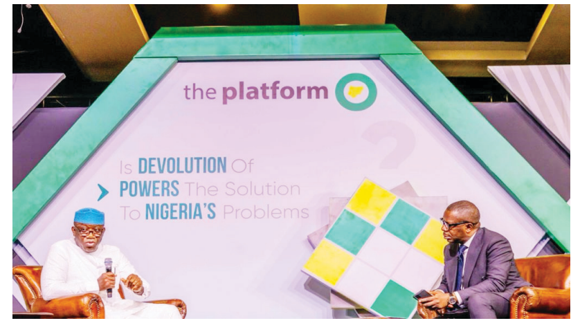
NGF Chairman Dr. J. K. Fayemi during a programme