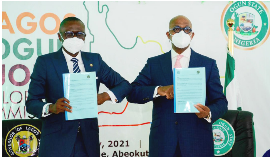
Governors Babajide Sanwo-Olu and Dapo Abiodun in a COVID-19 greeting to symbolise the signing of MOU between their respective states

According to Abiodun, the Joint Development Commission would forge a common alliance between the two states, to jointly tackle issues bordering on security, sanitation, traffic