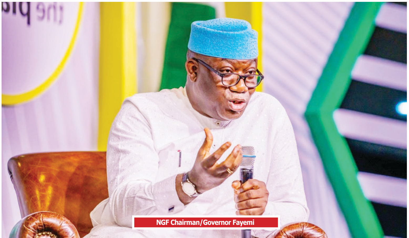
NGF Chairman/Governor Fayemi