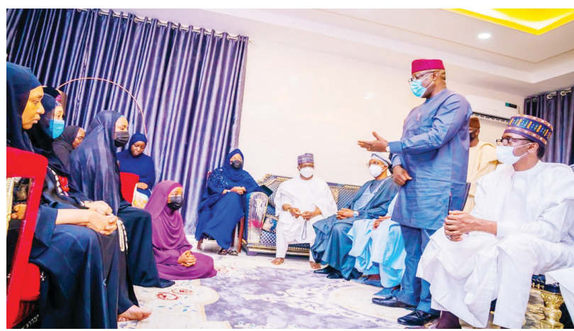
NGF Chairman delivering a condolence message to the widows of the deceased Military Officers