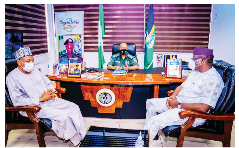
The IGP in a discussion with the NGF Chairman and Kebbi Governor Bagudu in his office