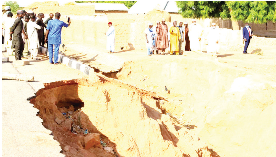
The erosion site visited by Governor Atiku Bagudu

from expanding into surrounding houses in the area.