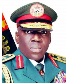
Late COAS, Gen. Attahiru

"The Nigeria Governors' Forum (NGF) received with deep shock and utter disbelief the death of the