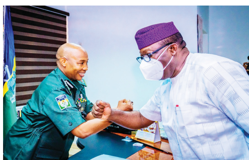
The IG of Police receives NGF Chairman when he paid him a courtesy call in his office