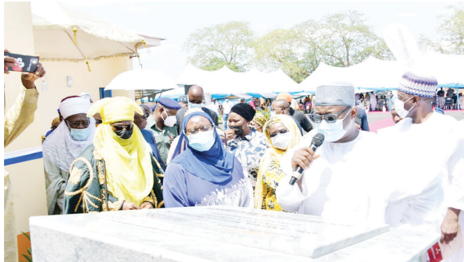
Governor Sani Bello commissioning the women's hospital in Kontagora

ral areas, they will go to either the primary health-care or hospital to give birth”, he said.