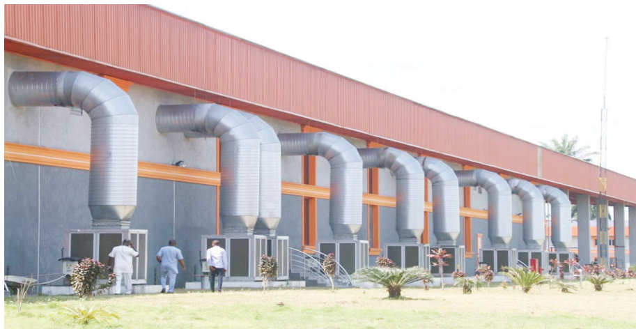
Akwa Ibom oil factory

re-activated to boost supply at the factory.