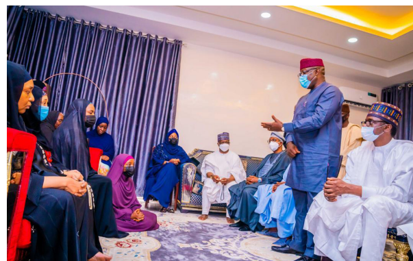
Gov. Fayemi at the funeral

"We also pray Allah (SWT) to grant late General Ibrahim Attahiru's family and the families of all involved the fortitude to bear this great loss to the country at large," Fayemi said.