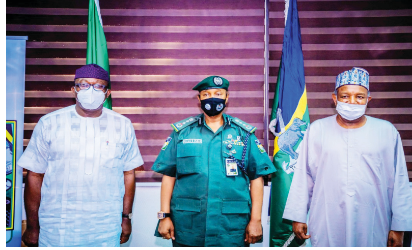
NGF Chairman, IGP and Progressive Governors Chairman, Atiku Bagudu