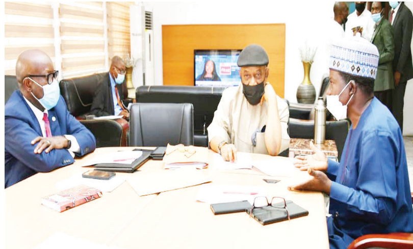
Governor Simon Lalong of Plateau State at a meeting with the Labour Minister in his office. With them is NGF DG, A. B. Okauru