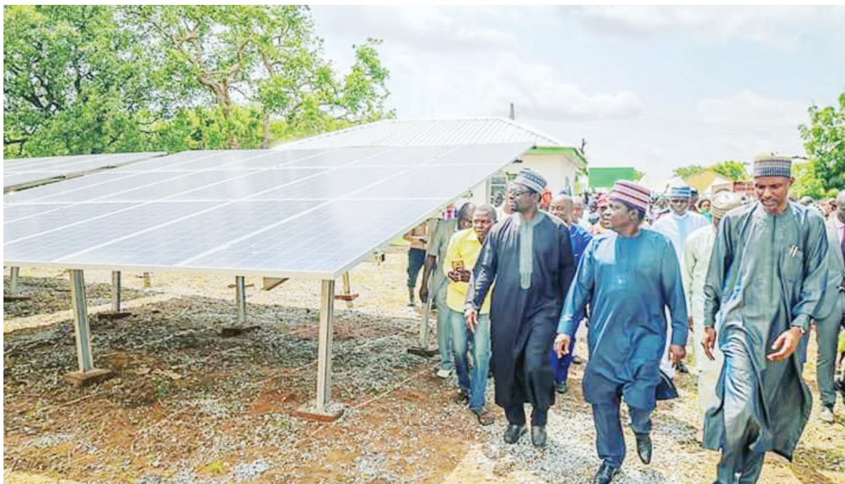
Governor Solomon Lalong inspecting newly installed solar panels

became the speaker of the assembly, occupying that position till the year 2006, following a political storm within the House. The seven years he served as the Speaker of that assembly made him the longest serving speaker of the House in the history of Plateau State. During that period he was two times (2001–2002) elected as the Chairman of the Conference of Speakers of the 36 states of Nigeria. In the year 2015, as the second tenure of the serving Governor of Plateau State, Jonah Jang, neared its end, Lalong joined the contest to succeed Jang. This time, he did so under the All Progressive Congress (APC) political platform. His chances seemed narrow at the beginning, but the capricious nature of politics tipped the balance eventually, favoring him by a slim margin. He was sworn in as the new Governor of Pla-