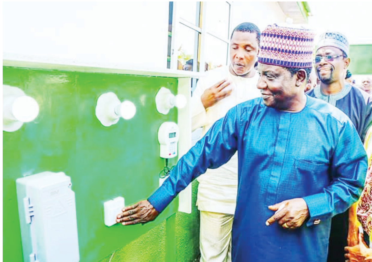
Governor Lalong commissioning a Solar Power Project