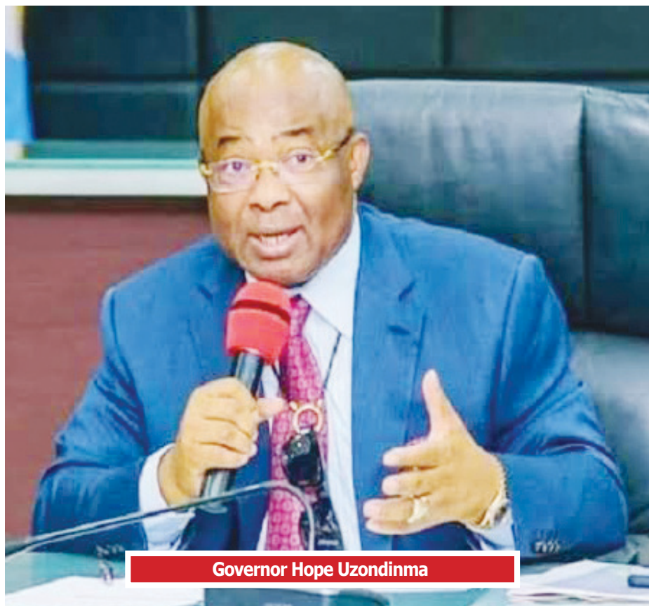
Governor Hope Uzodinma

In this edition of Governors Connect with the Youth Population and Road to A Violence-Free Nigeria, we feature the Governor of Imo State, His Excellency, Hope Uzodinma.