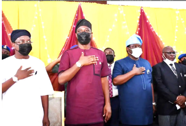
Gov Makinde at the ceremony

Party (PDP) had won all the 32 Chairmanship seats in the local government election held on Saturday.