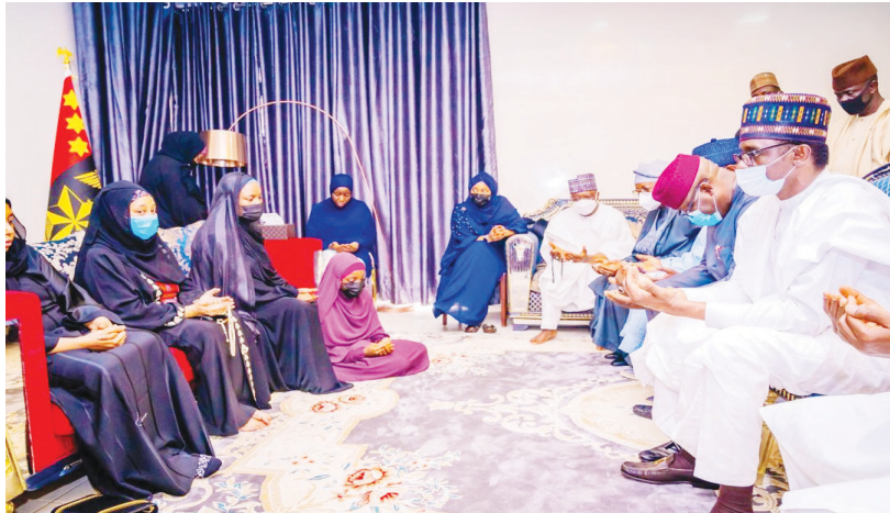
Yobe Governor and NGF Chairman at the condolence visit