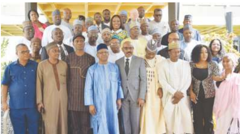
Participants in a group photograph with the minister of health