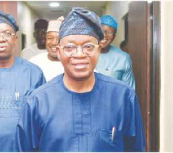
Governor, Adegboyega Oyetola