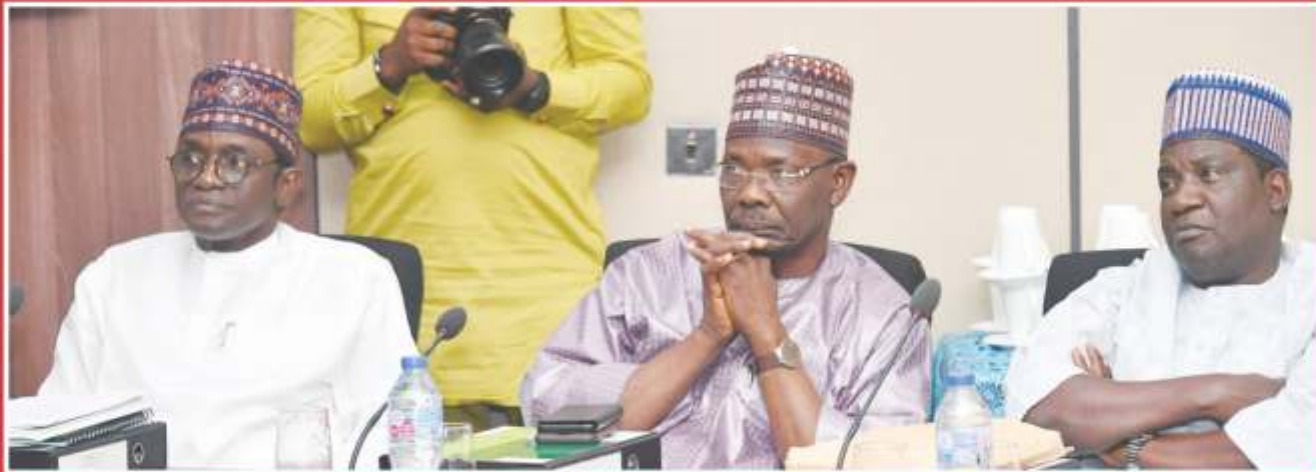
Govs Mai Mala Buni of Yobe, Abdullahi Sule of Nasarawa and Simon Lalong of Plateau