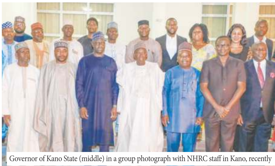
Governor of Kano State (middle) in a group photograph with NHRC staff in Kano, recently

Convinced by the records of human rights protection by the Kano state government under Dr Abdullahi Umar Ganduje, the National Human Rights Commission (NHRC) has described the state as human rights-friendly, calling other states to follow suit.