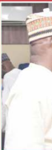
Gobs exchanging views