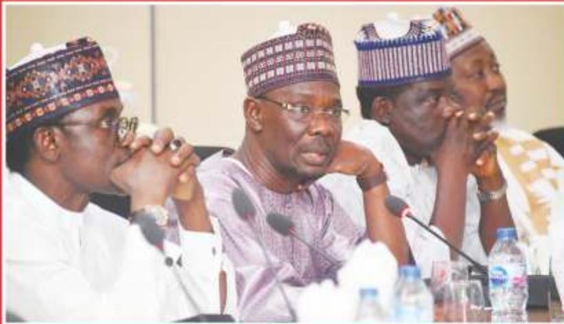
Cross-section of Gobs at the meeting