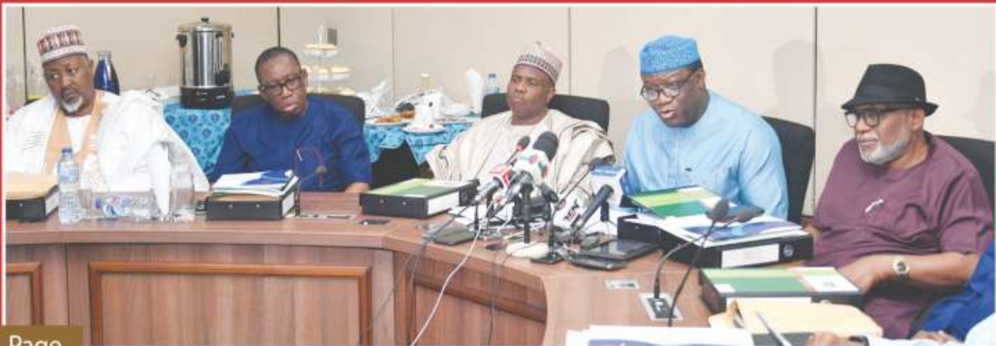
A section of gobs at the meeting