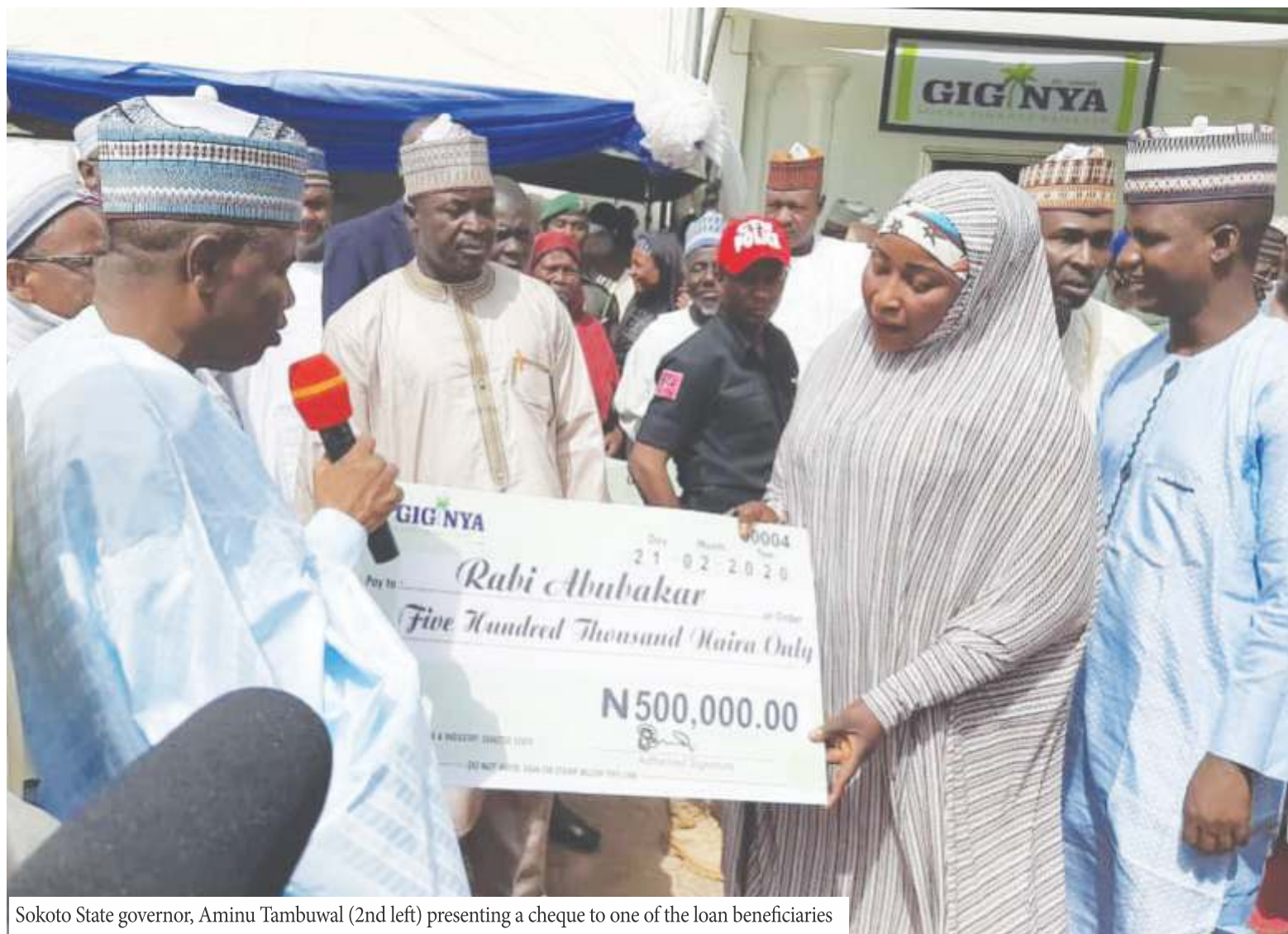
Sokoto State governor, Aminu Tambuwal (2nd left) presenting a cheque to one of the loan beneficiaries

The governor emphasized that his administration, is “ready to continuously empower traders and artisans to make their lives easier through provision of non-interest soft loans for their various businesses.