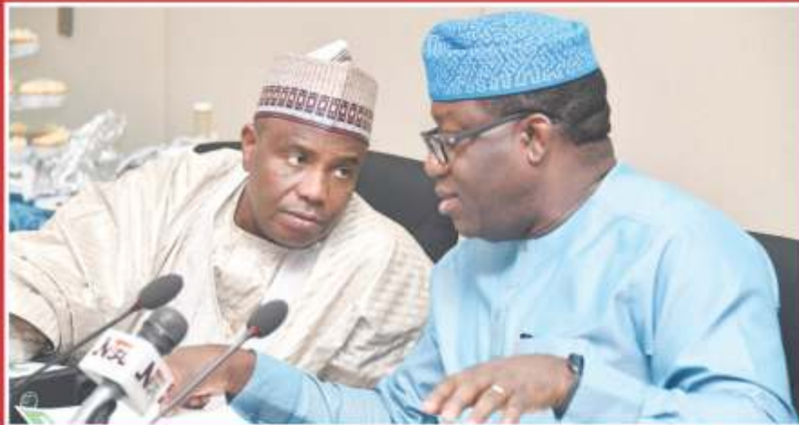
NGF Chairman, Kayode Fayemi and his Deputy, Aminu Tambuwal in a discussion