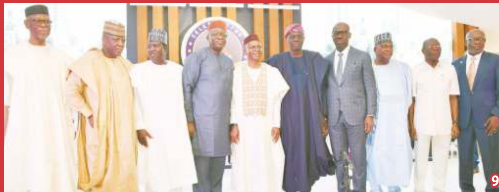
9. Governors, old and new in a group photograph with the celebrant