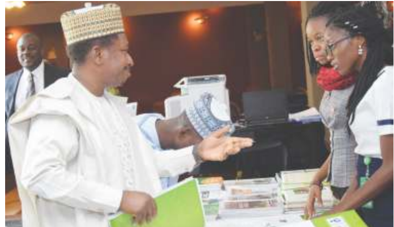
Registration at the occasion