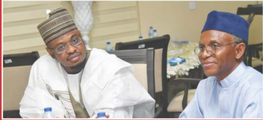
Kaduna State Governor, Nasir el-Rufai with Minister of Communications and Digital Economy, Dr. Ali Pantami