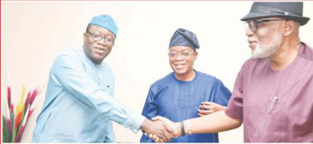
L-R: NGF Chairman and Ekiti State Gov, Dr Kayode FAYEMI; Osun Gov, Adegboyega Oyetola and Gov Rotimi Akeredolu of Ondo State, during the NGF January meeting