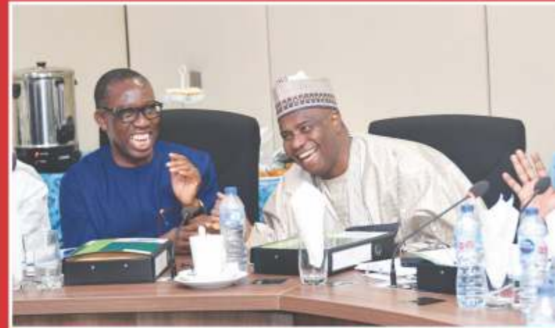
Gov Ifeanyi Okowa, Aminu Tambuwal and Kayode Fayemi share a laugh during the meeting