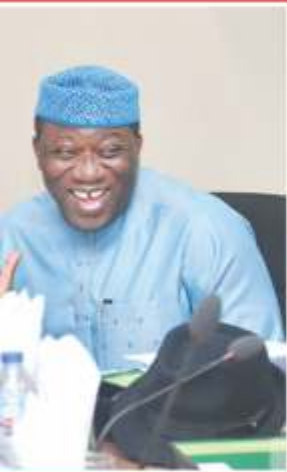
During the meeting