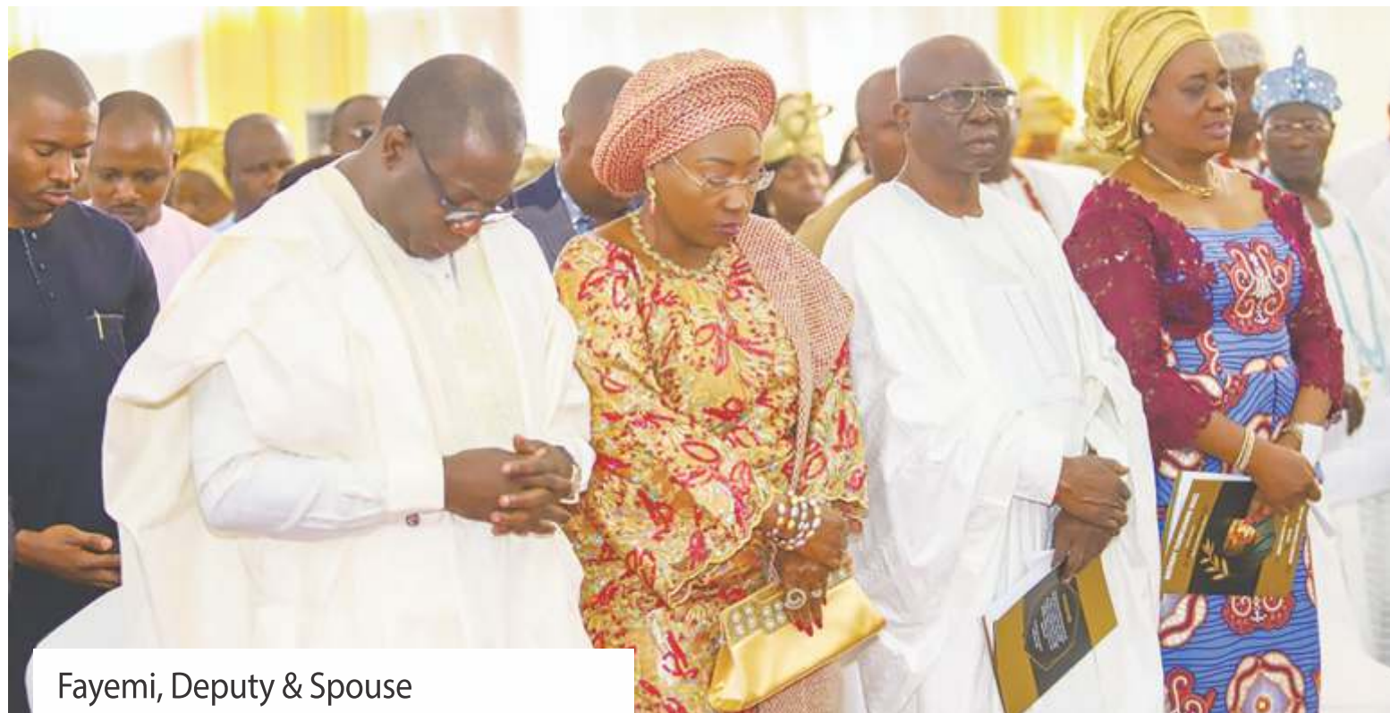
Fayemi, Deputy & Spouse

The play which featured some popular names in Nollywood set the tone for the main event of Sunday, February 9th.