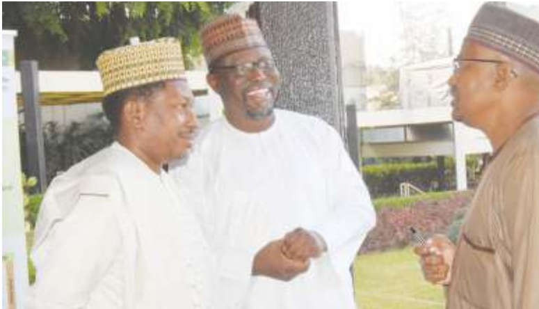
NGF Health Advisor in a conversation with State Health Commissioners