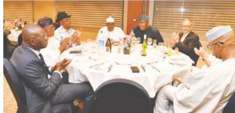
Governors @ Dinner