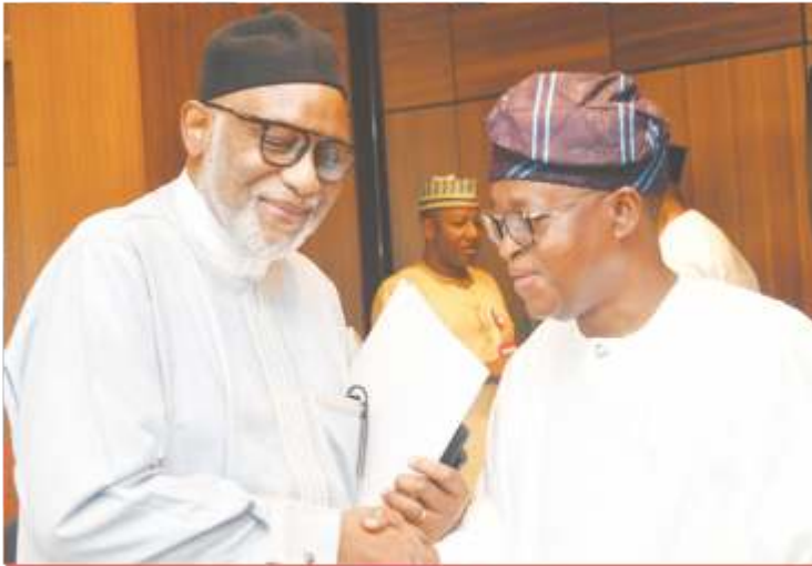
Ondo and Osun govts