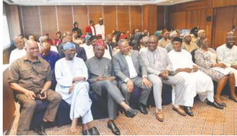
An array of Govt officials at the conference