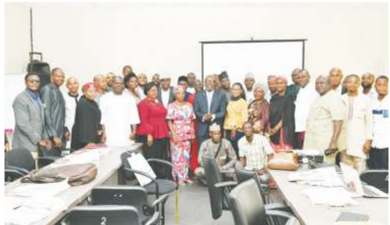
Participants group photo