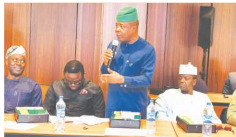
Ihedioha of Imo standing