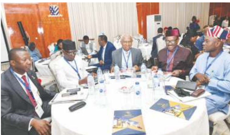
Breakout session in progress