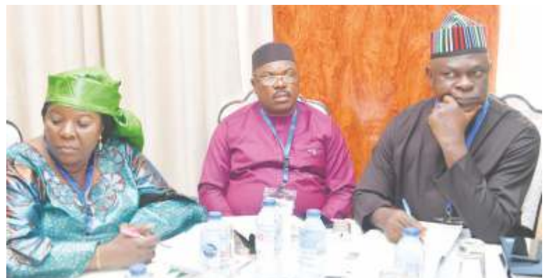
State officials at the event