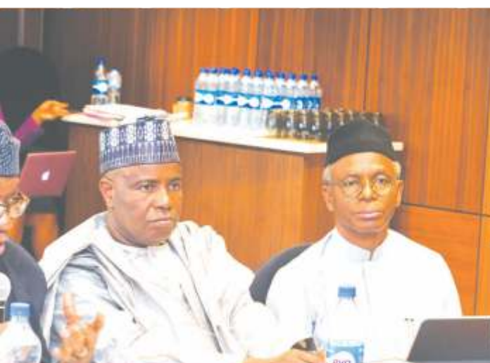
Fayemi, Rt. Hon Tambuwal and Gov el-Rufal