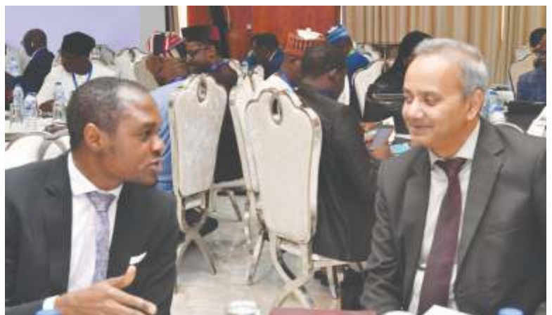
DFID's meets CD of World Bank