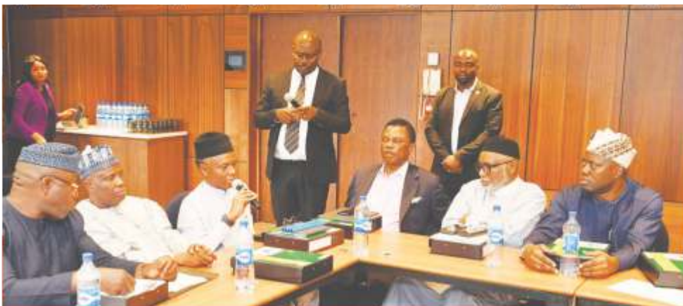
Meeting in session