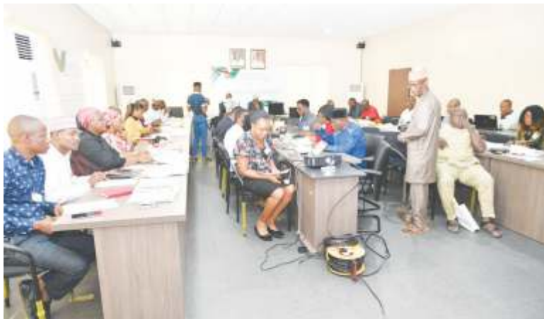
Class in session