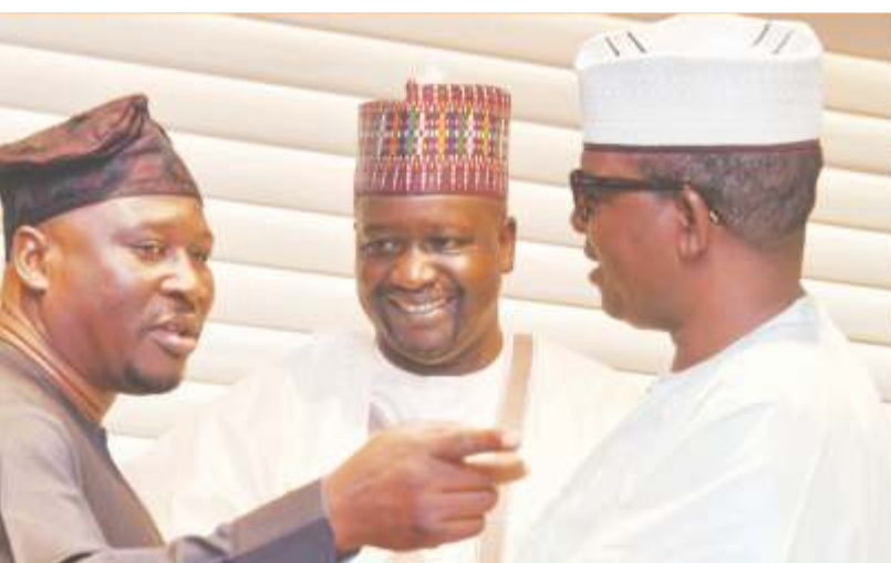
Adamawa's Gov Fintiri in a chat with Zamfara's Matawalle