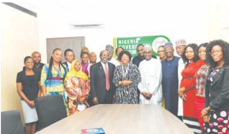
NGFS staff in a group photograph with the Chair of the NGNF after her maiden meeting of the NGFS