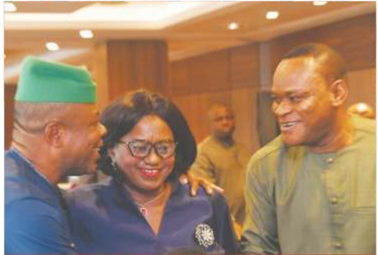
Ihedioha of Imo, Rivers and Anambra States