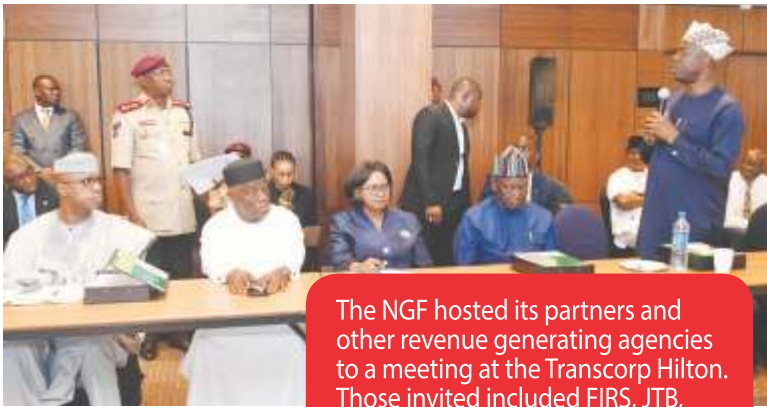
Gov Makinde speaking

The NGF hosted its partners and other revenue generating agencies to a meeting at the Transcorp Hilton. Those invited included FIRS, JTB, FRSC and others. More than ever before, the nation's revenue agencies are redoubling their efforts at Revenue mobilization and the NGF leads the game