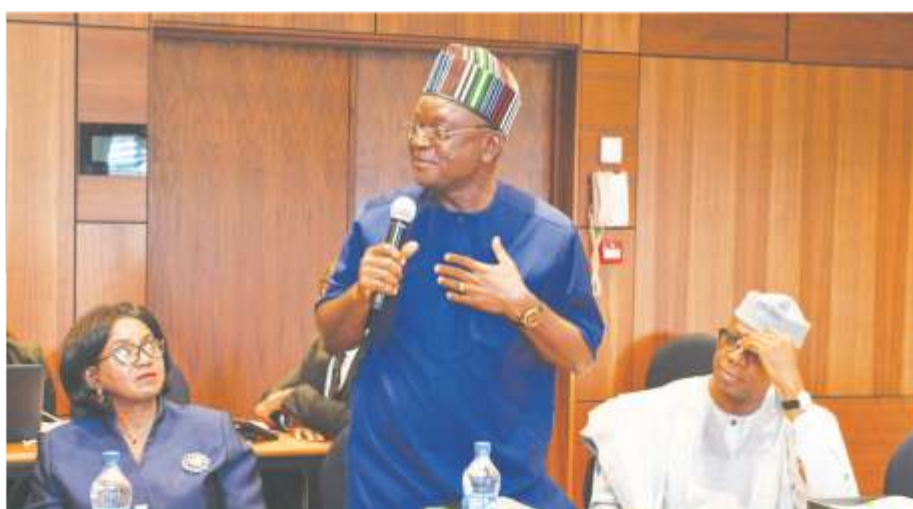
Ortom of Benue makes a point at the meeting