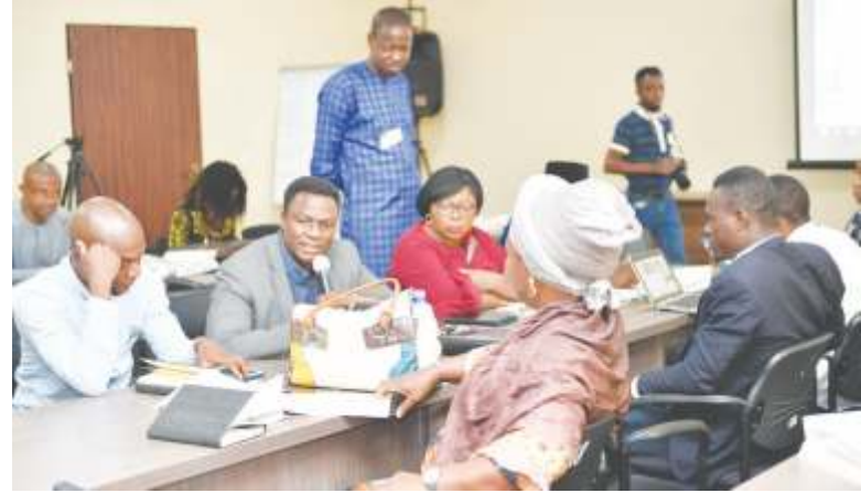
Conference in progress