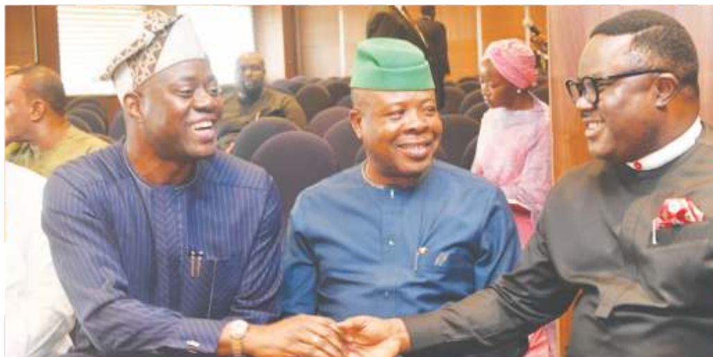
Makinde in handshake with Ayade, Ihedioha looks on.