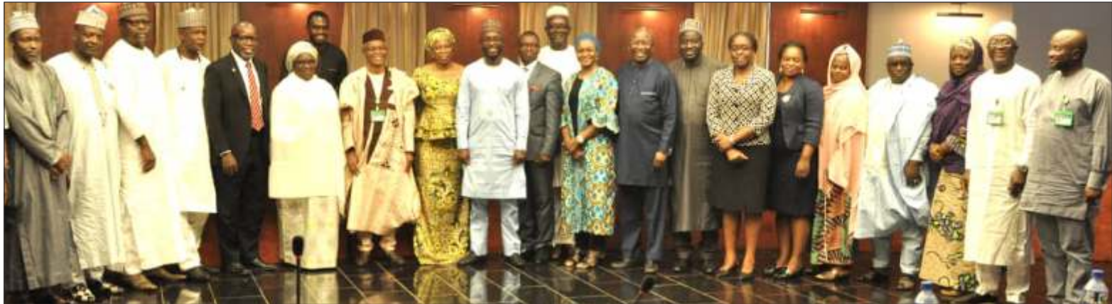
Kaduna State officials, the CWG, NGF and other partners in a group photograph

As part of efforts to improve human capital development which involves processes that relate to training, education and other interventions to increase the level of knowledge, skills, abilities, values, and social assets to improve performance to affect people's lives, economic and social development in many ways, the Nigeria Governors Forum (NGF) and its development partners, key among who is the Core Working Group (CWG) of the nation's Human Capital Development (HCD) plan, an initiative of the National Economic Council (NEC), recently re-energize the Nigerian people and particularly governments' functionaries and key stakeholders at the subnational level, to step up efforts to invest in capacity building and human development.