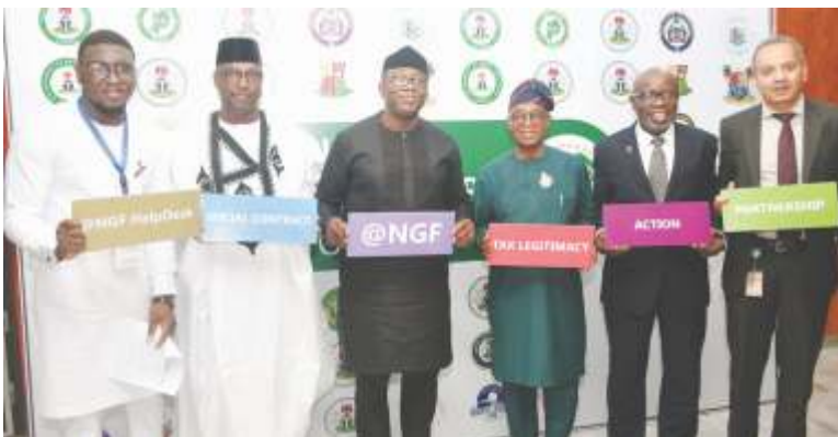
The NGF & its ethos