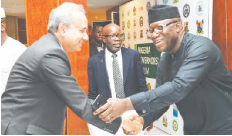
New WB Country Director Shubham Chaudhuri meets NGF Chairman & Gov of Ekiti State Dr JK Fayemi