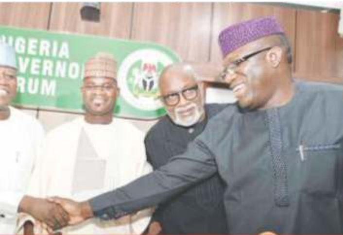
shakes hands with Fayemi; the old congratulates the new

State Governor, Kayode Fayemi emerged chairman of the forum