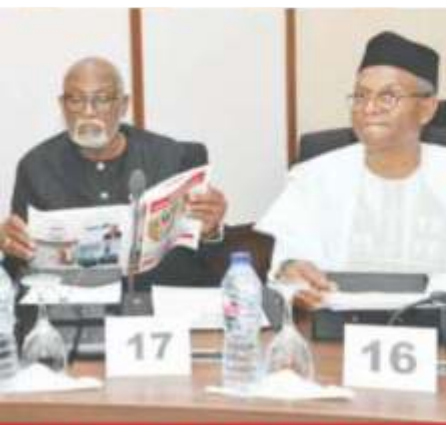
illo (l); Kaduna's el-Rufai (r) and Ondo's reading the Executive Summary