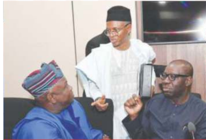
Lagos, Kaduna and Edo governors in banter