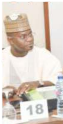
Kogi's Yahaya Be Akeredolu