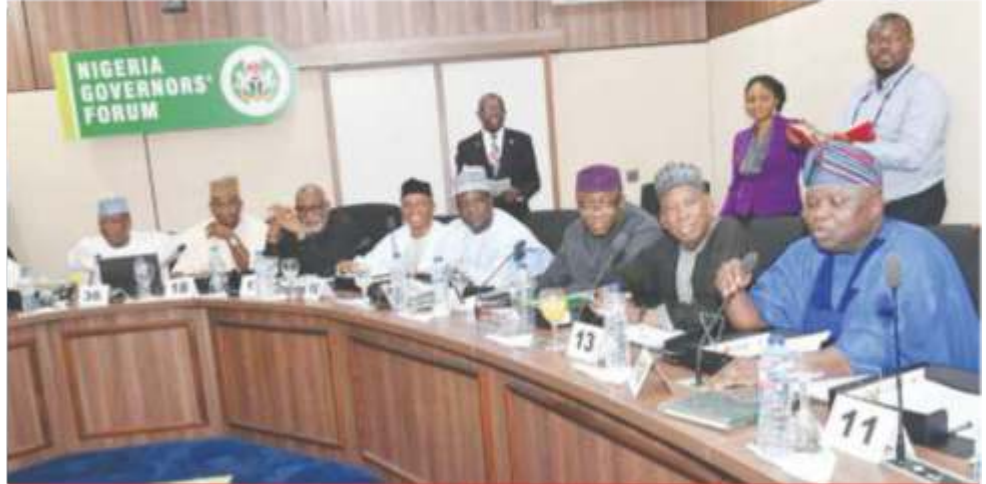
A cross section of governors at the meeting