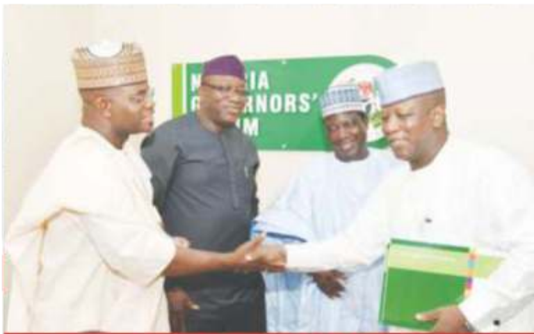
Yahaya Bello wishes Chairman Yari the best in the future