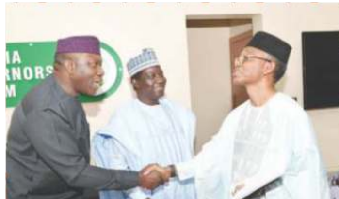
el-Rufai congratulates his nominee as Lalong, Chairman Northern Governors' Forum looks on with a smile