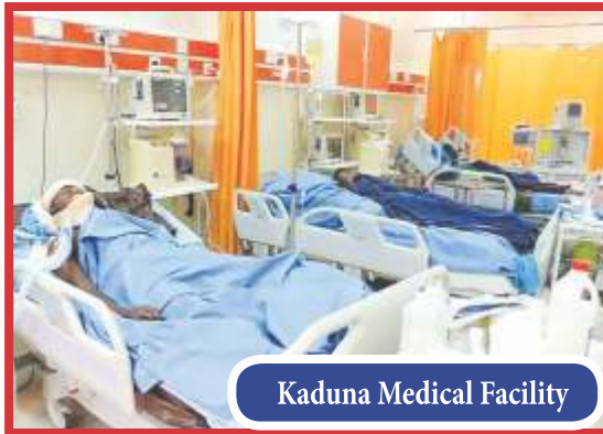
Kaduna Medical Facility

In his inaugural address, the governor went conciliatory by saying that his is a people's government and will operate as such. When everybody expected him to sound like a belligerent war general on the actions of the previous government, he made it clear that whatever inquiry made into the past would be to the extent that such effort will help the public cause he intends to serve. In saying this, Abdulrazaq was clear about the fact that he is not interested in running after