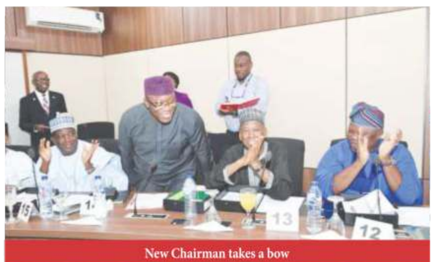
New Chairman takes a bow