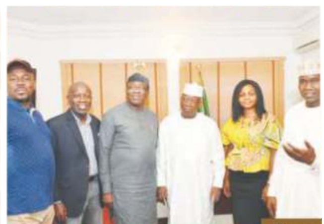
NGF staff at the hand over ceremony