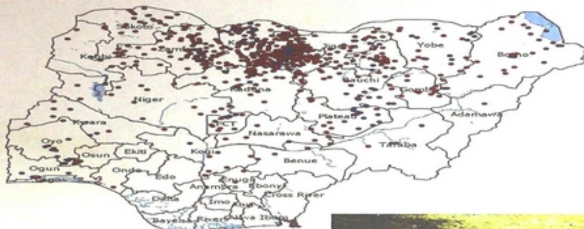
Nigeria WPV cases 2008 (797)– as at January 9, 2009