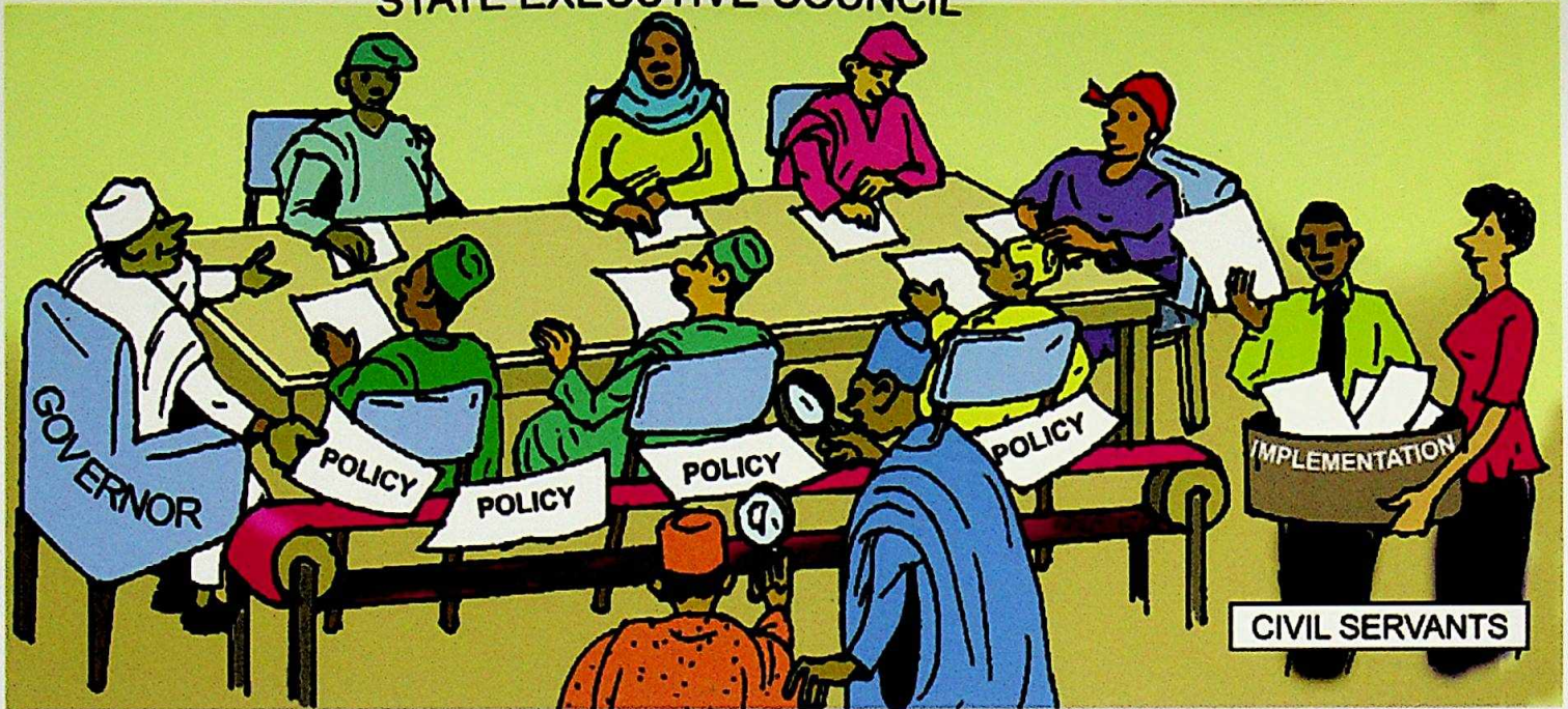
STATE HOUSE OF ASSEMBLY