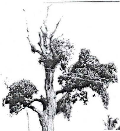
Iroko tree planted in 1150, Akure

out of the former Western State. The state covered the total area of the former Ondo Province, created in 1915 with Akure as the provincial headquarters.