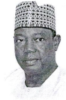
Governor Aliyu Akwe Doma