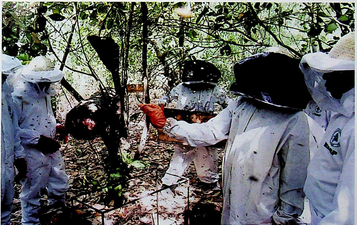
YOUTH BEING TRAINED IN BEE HONEY PRODUCTION

2,000 youth are being proposed to be screened and trained in bee honey making in addition to the over 200 youth who were already sponsored and trained by the state.