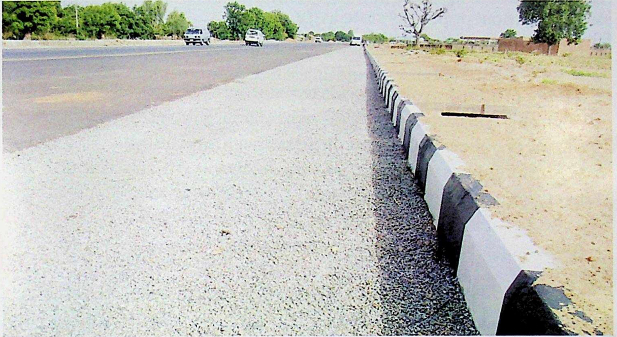
ROADS CONSTRUCTION TO FACILITATE TRANSPORTATION OF PEOPLE AND GOODS

The government has also embarked on provision of additional infrastructures like urban and rural roads that will facilitate transportation of goods and materials, hence improving productivity at all levels.