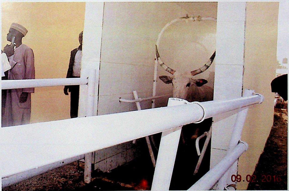
SPRAY RAYS, KADAWA ARTIFICIAL INSEMINATION CENTRE,