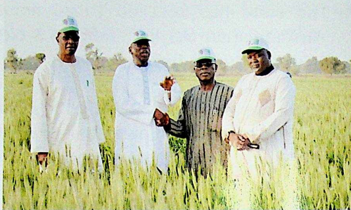
ALKAMAWA DRY SEASON WHEAT FARMING, ALKAMAWA VILLAGE, BUNKURE LOCAL GOVT. KANO STATE