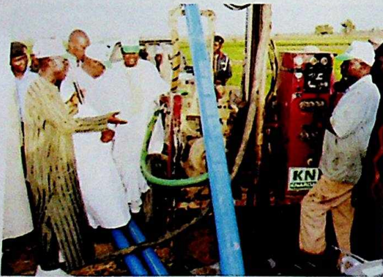
Launching of 1000 nos. Tube wells

These are part of the support being rendered by the state to foreign and local investors, and many more.