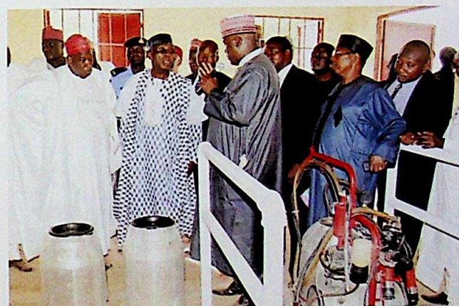
MILKIN PARLOUR, KADAWA INSEMINATION CENTRE,