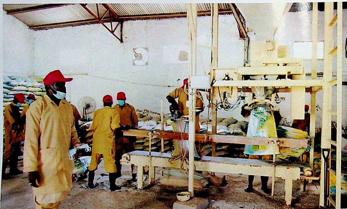
Fertilizer production section at the Kano Agricultural Supply Company (KASCO), another significant investment sector