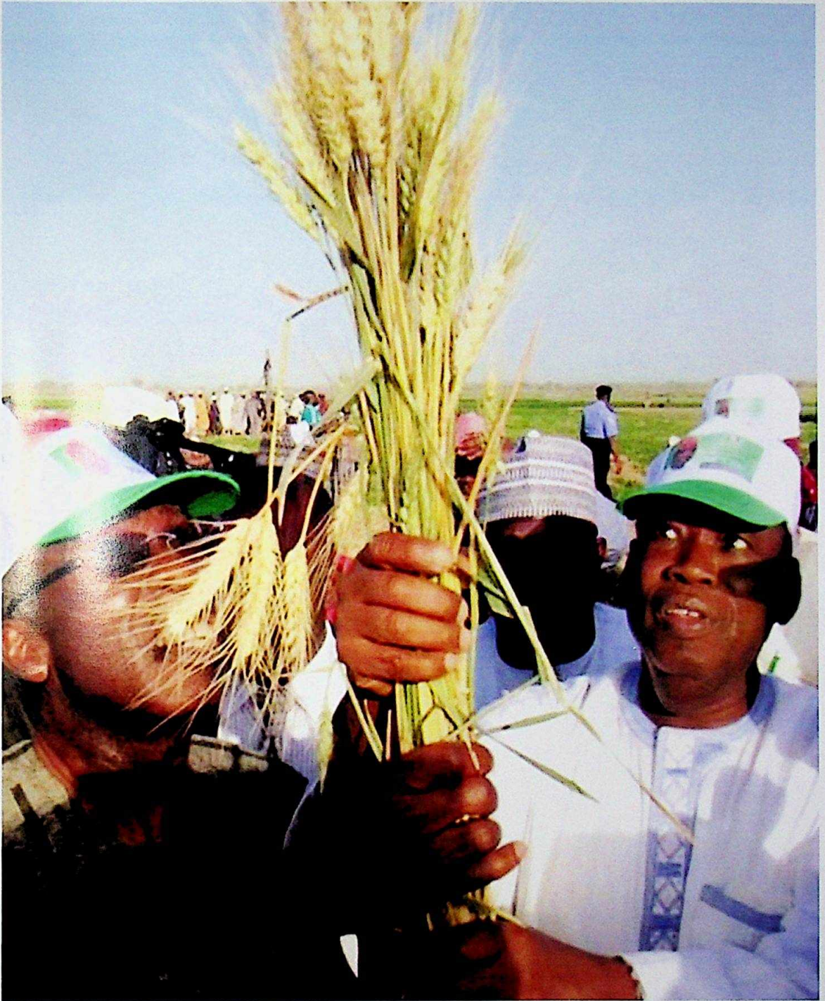
Governor Abdullahi Umar Ganduje of Kano State and Nigeria's Minister of Agriculture, Chief Audu Ogbeh displaying newly harvested wheat at Alkamawa Village in Kano State