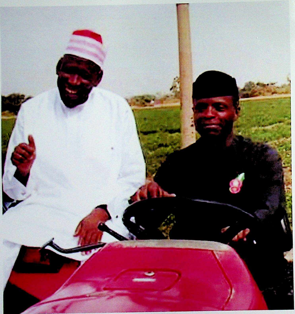
Nigeria's Vice President, Yemi Osinbajo, cheered by Governor Abdullahi Umar Ganduje of Kano State, test - driving a tractor at the Dangote Farms in Kano state