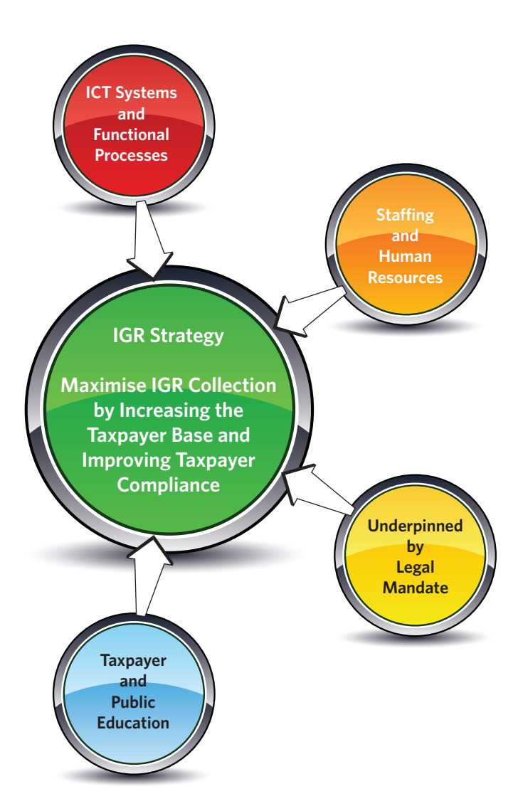
Figure 1: IGR Strategic Framework

the cash flows and financial position of a state. However, it can help to provide a 'roadmap' on how to go about developing an IGR improvement and maximisation strategy.