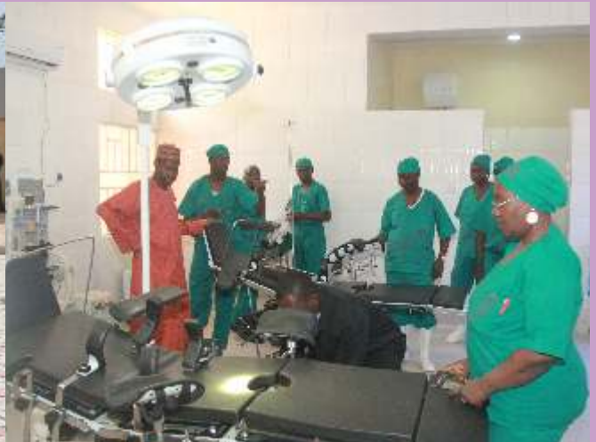
Mohammad Shuwa Hospital