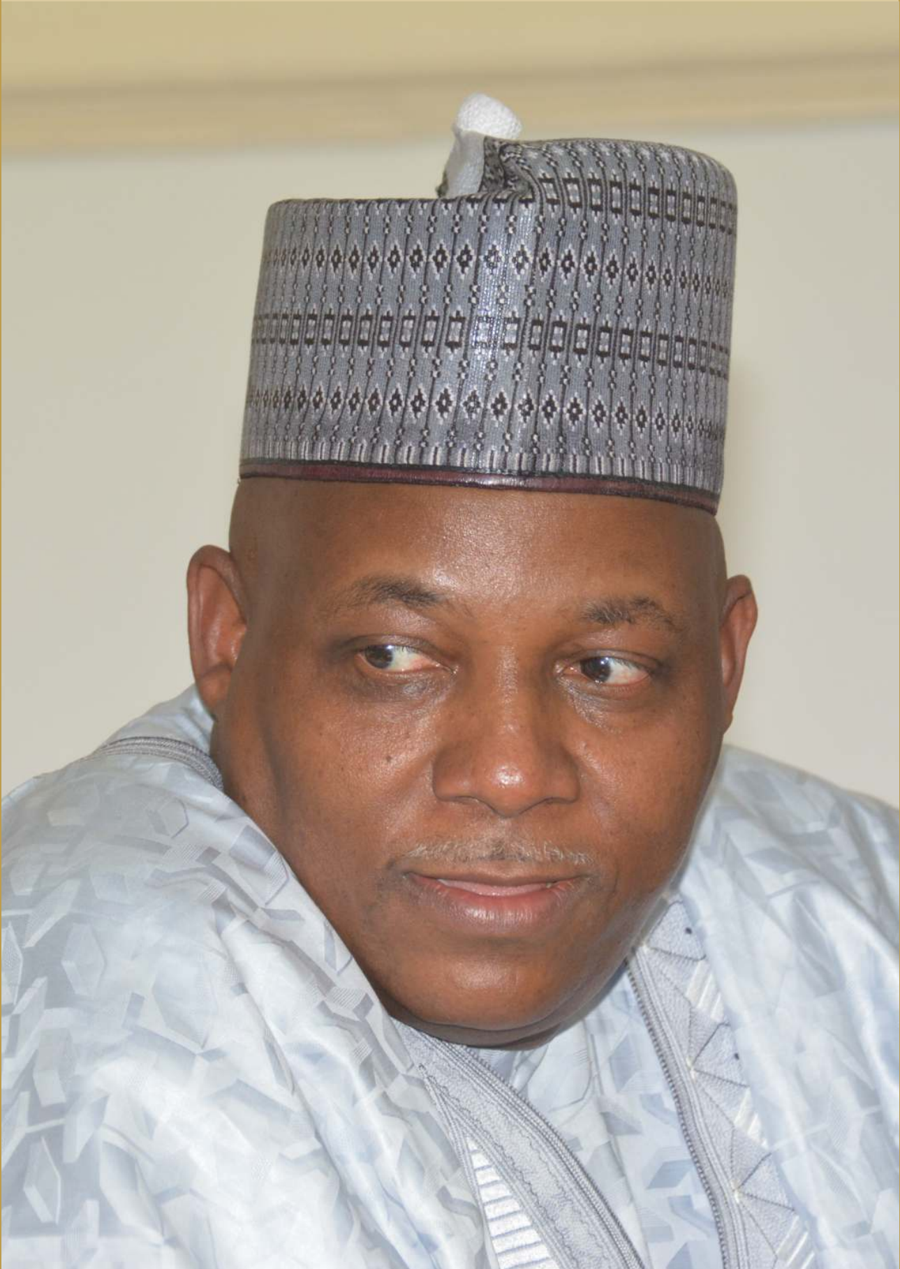
His Excellency, Honourable Kashim Shettima Executive Governor of Borno State