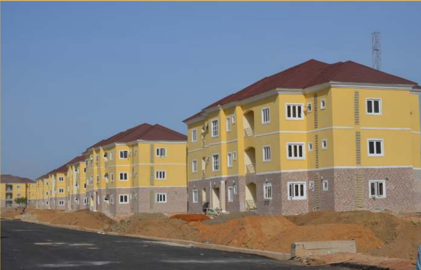
The Legacy Garden in Maiduguri