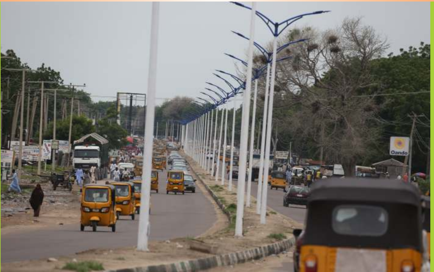
Installation of Street Light