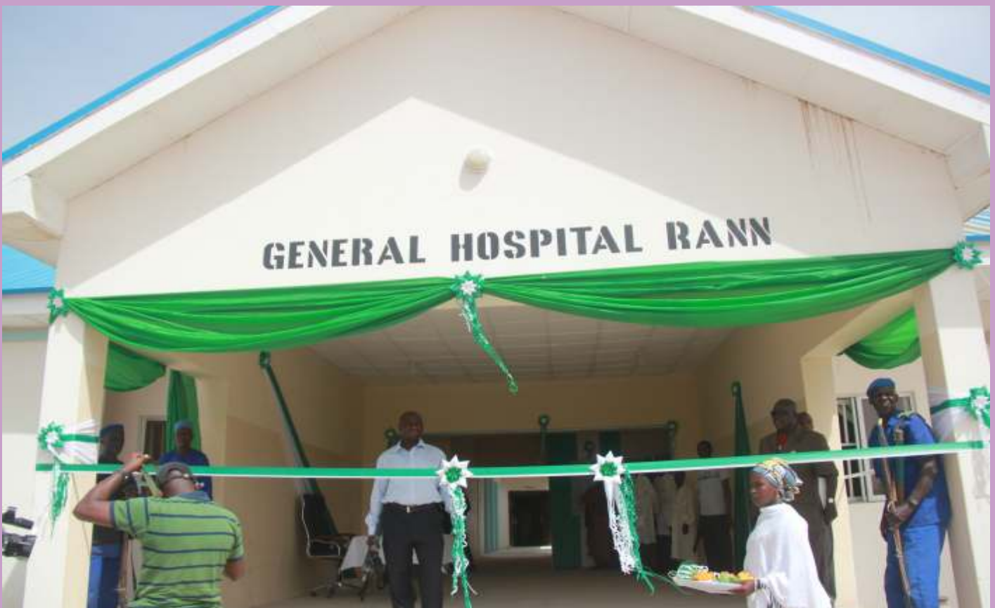
General Hospital Rann