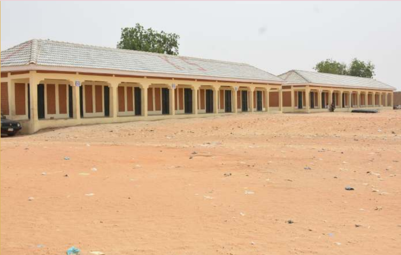
New Shops Built at Weekly Market in Ngamdu Kaga LGA