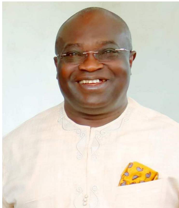
OKEZIE VICTOR IKPEAZU, Ph.D EXECUTIVE GOVERNOR ABIA STATE