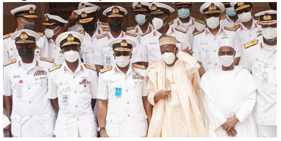
Governor Ganduje {3rd right} with the Naval personnel during their courtesy visit

As a response to Governor Abdullahi Umar Ganduje's request for the Nigerian Navy's visibility in the state which will strengthen the security of the state, the Nigerian Navy approves the establishment of Kano Naval Base.