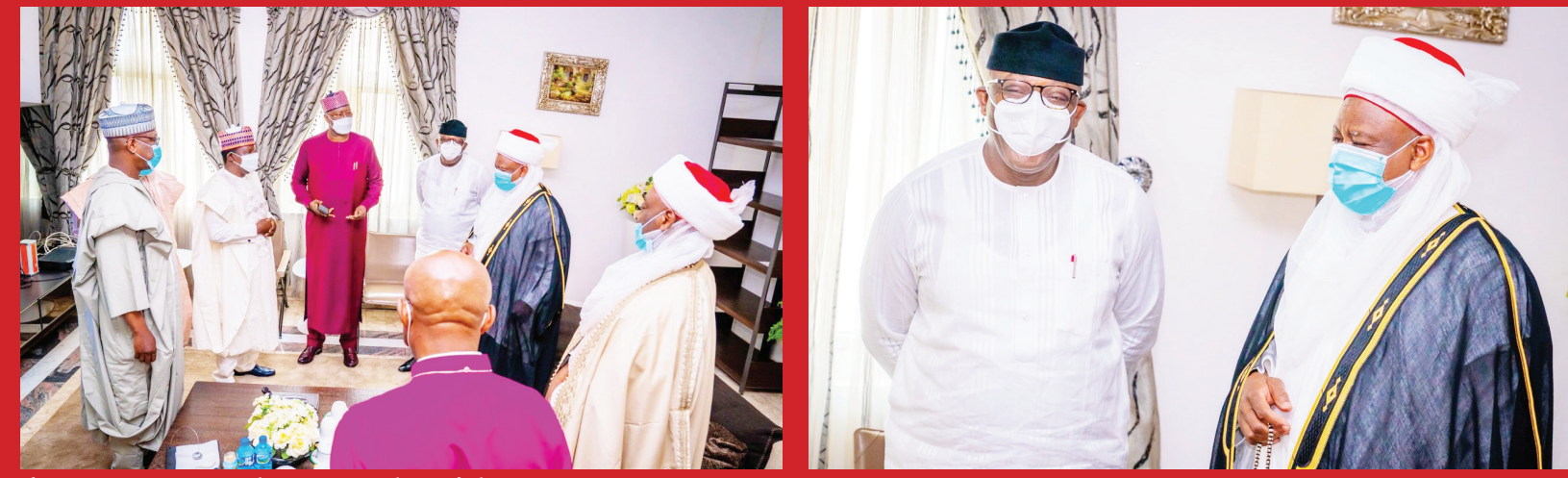
The Peace team meets with Governor Lalong of Plateau State