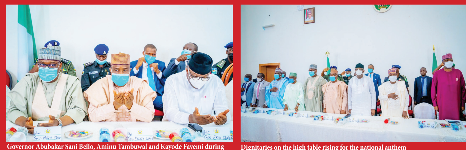
prayers at the meeting