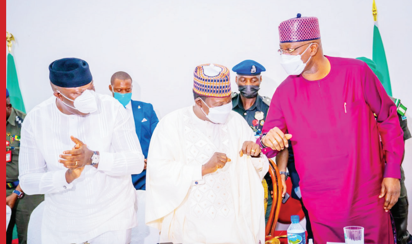
Governor Simon Lalong and Governor Kayode Fayemi exchanging pleasantries Governor Kayode Fayemi and Simon Lalong exchange pleasantries with the SGF Boss Mustapha