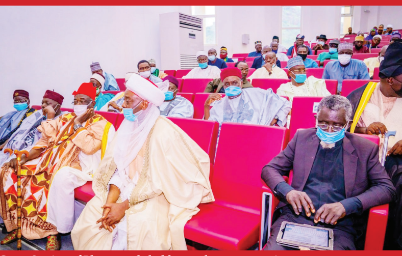
Cross-Section of Plateau stakeholders at the peace meeting