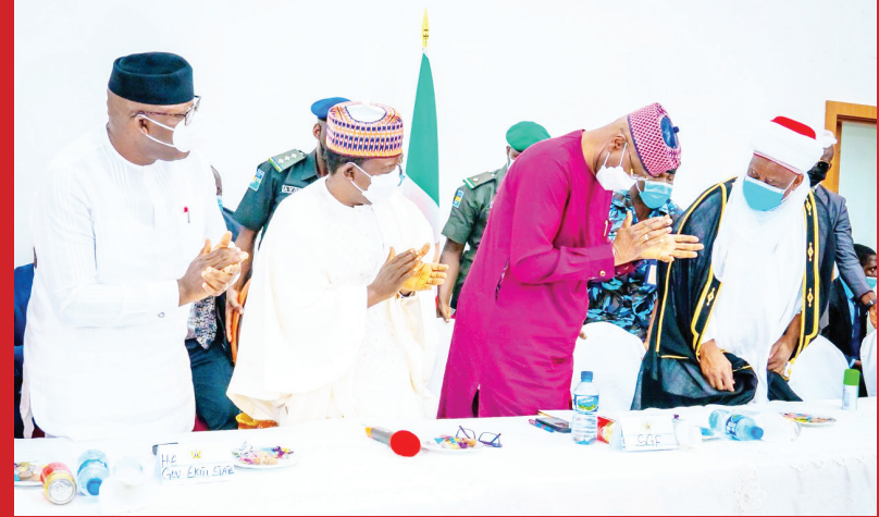
Governors Fayemi and Lalong with SGF Mustapha and the Sultan of Sokoto