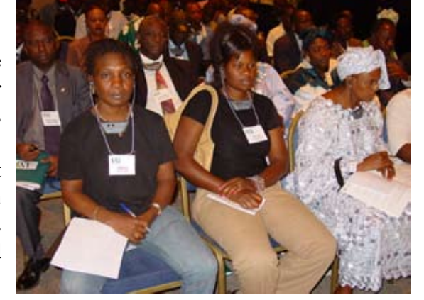
Journalists take notes during the press conference.

The Initiative received significant press coverage before, during, and after the symposium. Newspaper articles were published in more than 25 media outlets in countries across Africa. In addition, several international media outlets published stories about the conference and featured live interviews with some of the participants. (See Appendix E for press releases and Appendix F for a listing of articles and interviews on ASI.)