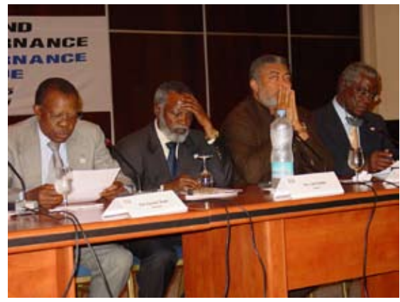
Former President Ketumile Masire of Botswana (left) reads the Bamako Declaration at the final press conference, while former and Manuel Pinto da Costa of Sao Tome and Principe look on.

During the concluding press conference, participating African leaders presented the "Bamako Declaration of the African Statesmen Initiative," a joint communiqué issued to reinforce their commitment to be lead advocates for presidential leadership and good governance in Africa. In the declaration, the African former heads of state and government participating in the symposium expressed their commitment to "continuing to use our good offices to foster dialogue and the peaceful resolution of the continent's conflicts, and to promote human security and democratic models of government that offer citizens the opportunity to choose their leaders freely and participate fully in the political life Presidents Sam Nujoma of Namibia, Jerry Rawlings of Ghana, of their countries." They also pledged to address "the