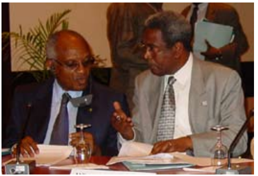
Former Presidents Miguel Trovoada of Sao Tome and Principe (left) and Antonio Mascarenhas Monteiro of Cape Verde (right) discuss issues raised during the panel

It was recommended that ASI become a focal point for creating multi-country, regional, or continent-wide partnerships and strategies to address health concerns. Panelists agreed that former heads of state must summon the collective will to speak out and, where necessary, assist current leadership to address these deadly diseases that threaten peace, prosperity, and democratic development.