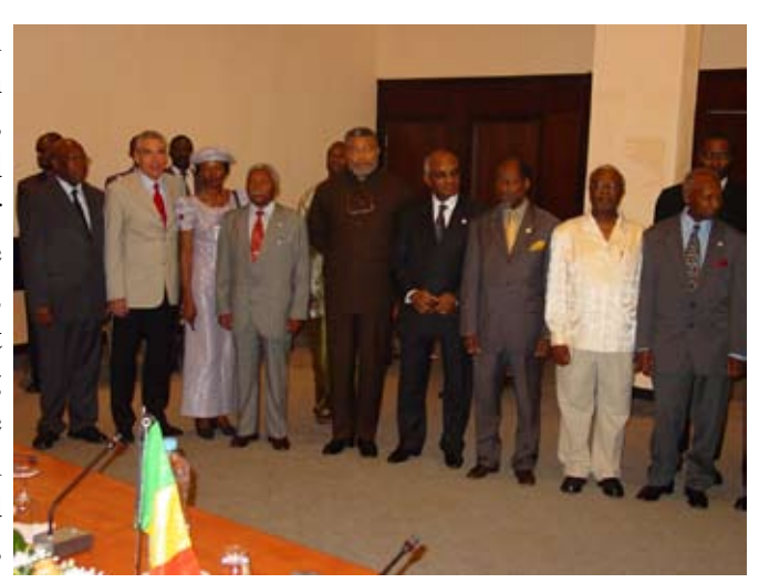
Former heads of state and government gather at the inaugural symposium of the African Statesmen Initiative.

A consensus on criteria for participation in ASI was reached through consultations with African former heads of state, as well as NDI's partner organizations. Those criteria included former leaders who voluntarily left office or stepped down following electoral defeat, were democratically elected but deposed by a coup, or retired from partisan political activity but continue to champion good causes. Using these criteria, 25 African former heads of state were identified and invited to participate in the program. Invitations were also extended to several former prime ministers and heads of government from Africa and other regions of the world.