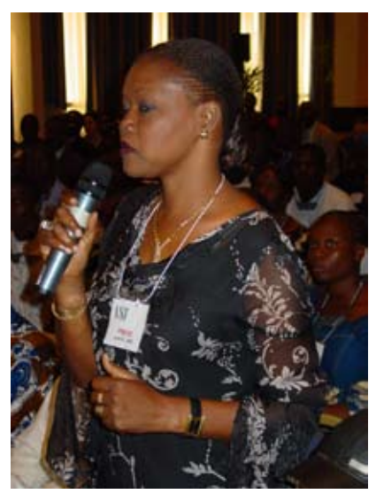
A journalist questions participants at the press conference.

peace within nations is a vital factor for human progress. They also urged African leaders to serve as counterweights to voices of extremism, both globally and in parts of Africa. They noted that former heads of state can alert citizens about the dangers of terrorism and internecine conflicts, which inhibit development and nation-building.