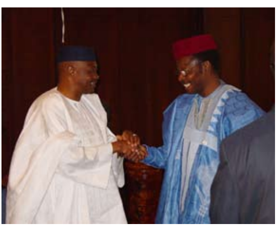
Malian President Amadou Toumani Touré (left) greets former Nigerien President Mahamane Ousmane (right).

Credible elections and a peaceful turnover of political power in many African countries during the last decade have led to a noticeable expansion of political space on the continent. While in 1975, Freedom House ranked three sub-Saharan African countries as "free" and 16 as "partially free," by 2004, 10 were ranked as "free" and 20 as "partially free." Africa now enjoys increased freedom of independent media, the emergence of a vibrant civil society and a greater number of women running for public office. Moreover, new initiatives have emerged within the African Union to foster economic and political development, including NEPAD and the peer review mechanism, as well as the Peace and Security Council.