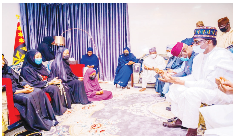
Yobe Governor and NGF Chairman at the condolence visit