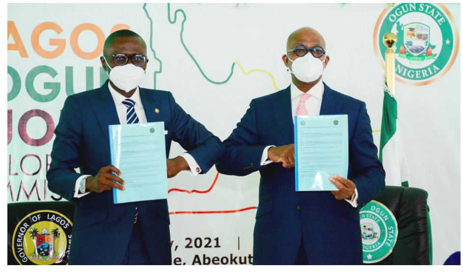
Governors Babajide Sanwo-Olu and Dapo Abiodun in a COVID-19 greeting to symbolise the signing of MOU between their respective states

According to Abiodun, the Joint Development Commission would forge a common alliance between the two states, to jointly tackle issues bordering on security, sanitation, traffic