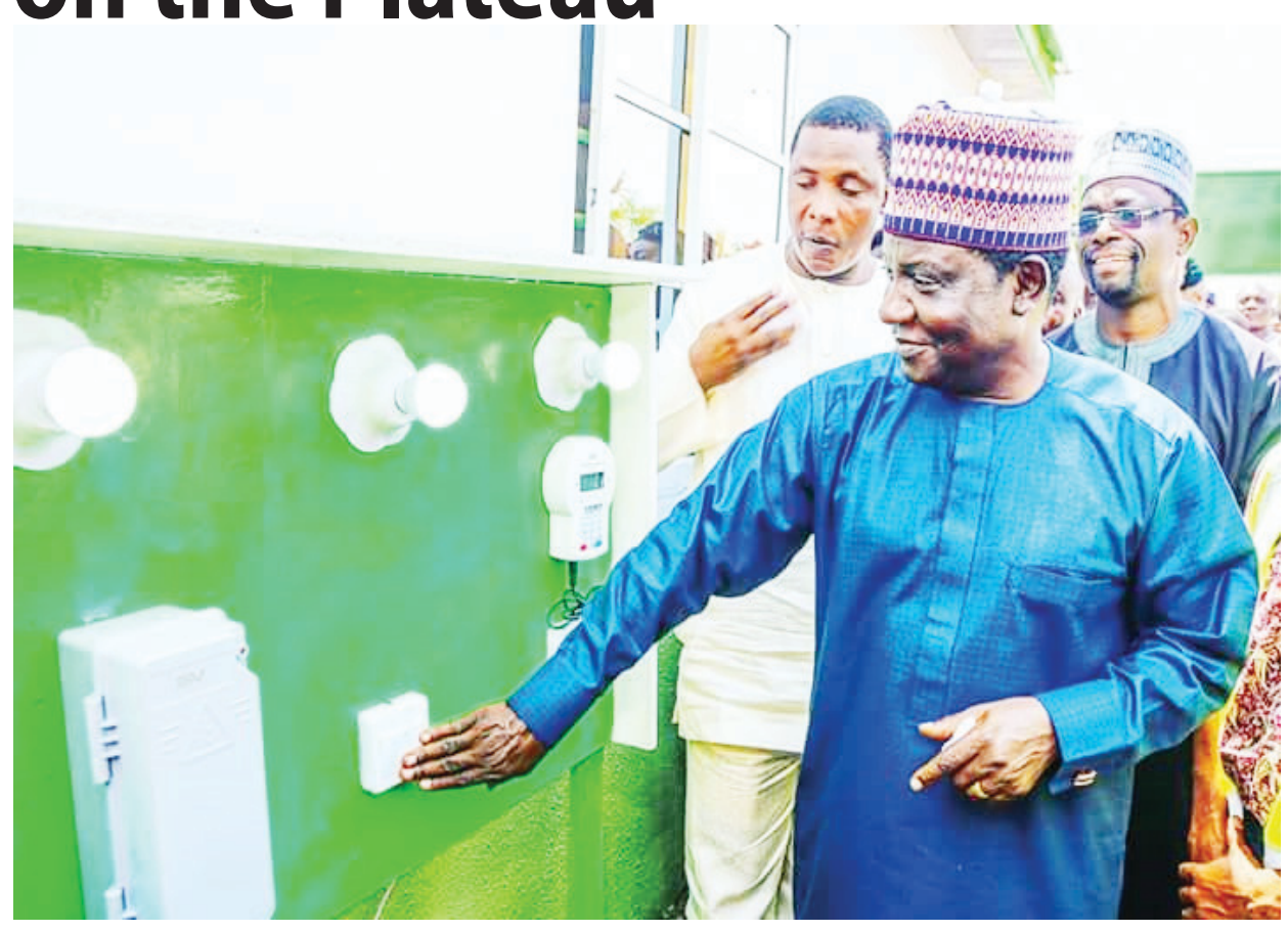
Governor Lalong commissioning a Solar Power Project

Lalong: A rare peacemaker on the Plateau