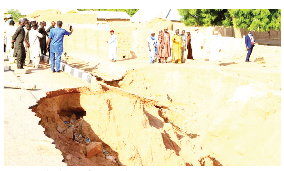
The erosion site visited by Governor Atiku Bagudu

from expanding into surrounding houses in the area.