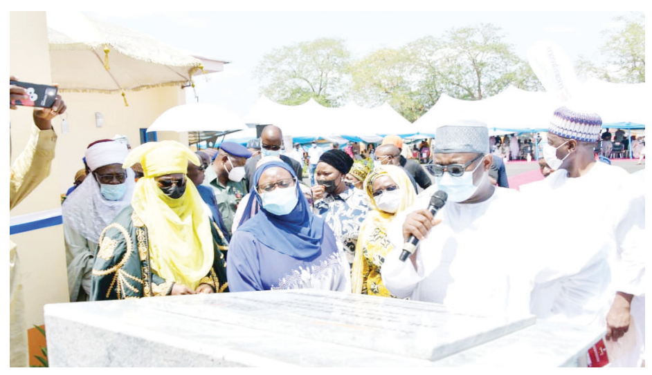
Governor Sani Bello commissioning the women's hospital in Kontagora

ral areas, they will go to either the primary healthcare or hospital to give birth", he said.