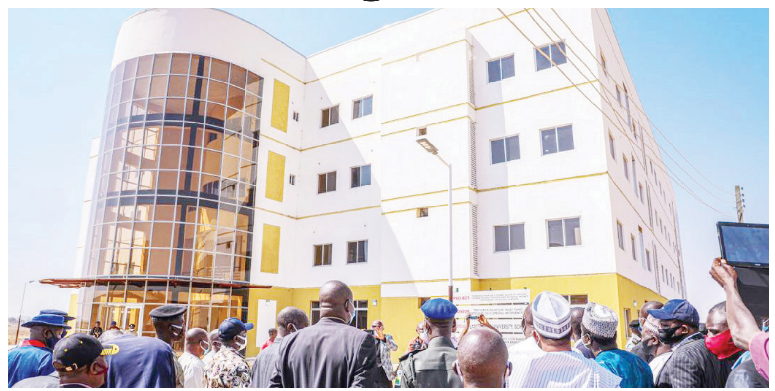
Newly Completed Faculty of Social Sciences, Plateau State University Bokkos