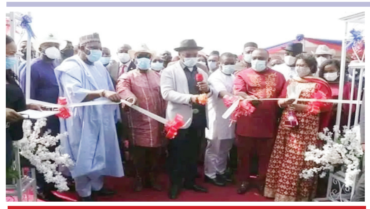
Governor Udom commissiong Norfin Offshore Shipyard