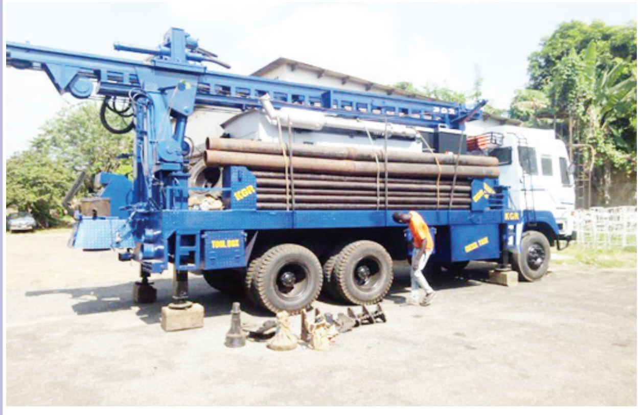
An Oyo State Government water drilling truck

He said: "Today, I am giving the go-ahead for Phase 2 [of the Akesan Market Project] to start in earnest. The developer mentioned that we can attain completion for both phases within another three or three and a half months.