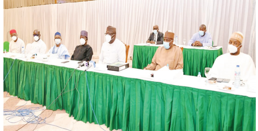
Cross-section of Governors at the meeting