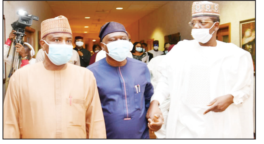
Governors Tambuwal, Fintiri and Matawalle