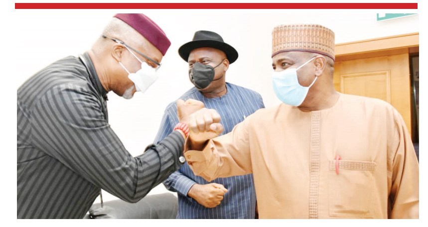
Governor Tambuwal exchanging pleasantries with Deputy Gov of Anambra State while Gov Diri looks on