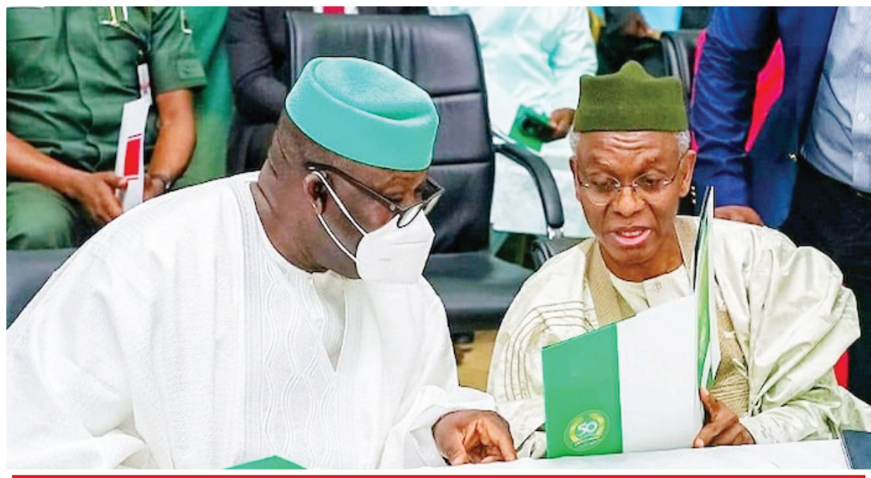
Governor Fayemi and El-Rufai of Kaduna State

rectify the anomaly of a federation that has a more or less unitary judiciary. I am firmly convinced that restructuring on the lines proposed by our committees is a nation-building opportunity that will allow states to exercise consequential powers, assume more responsibilities and control resources to enable them deliver better outcomes for those they govern.