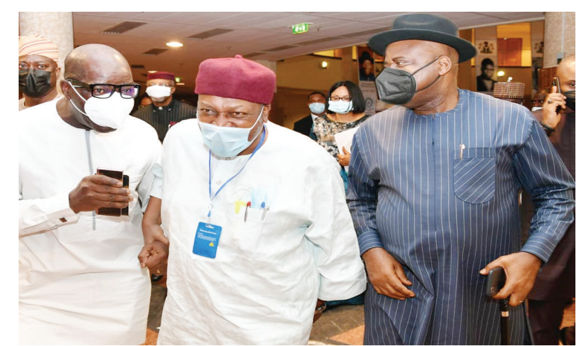
Governors Obaseki, Ishaku and Diri share a moment.