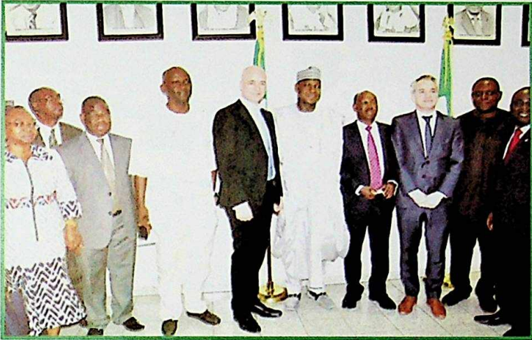
EITI Delegation led by EITI International Chair Designate, Fredrik Reinfedit in company of NEITI Management on a visit to the Hon. Speaker, House of Representatives, Hon. Yakubu Dogara, at the National Assembly Complex, Abuja, Nigeria