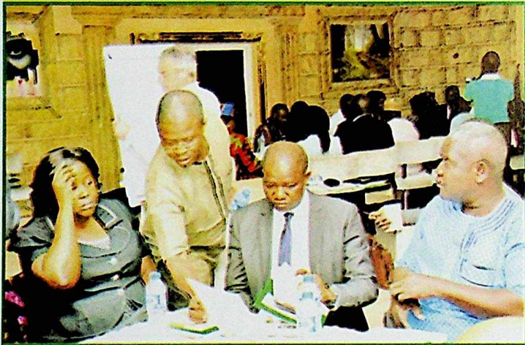
Representatives of Civil Society and the Media during NEITI - EITI Pre-Validation Workshop in Abuja, Nigeria