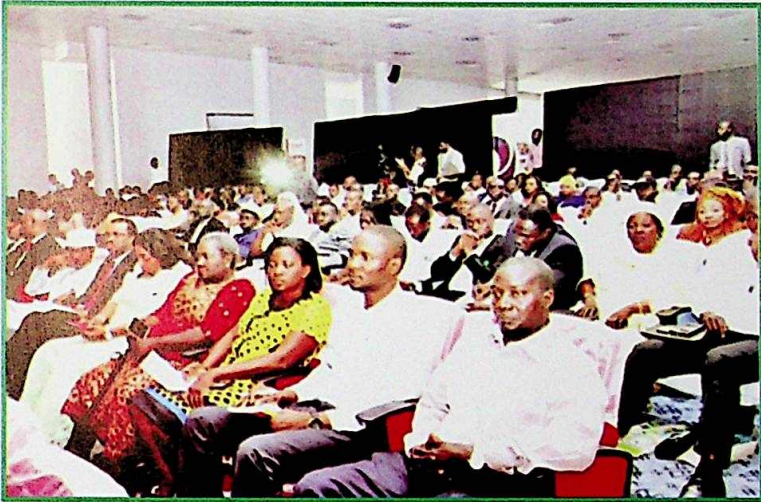
Cross Section of Stakeholders at NEITI Programme