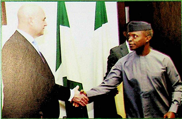
Nigeria's Vice-President, Professor Yemi Osibajo welcoming the EITI International Chair Designate Fredrik Reinfeldt to his Office at Aso Rock Villa, Abuja during the EITI delegation's working visit to Nigeria.